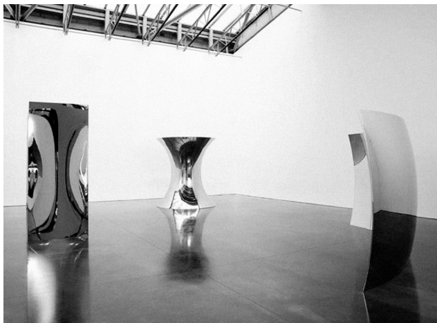
Anish Kapoor, Non-object (Door) , 2008

B. – So, shut up. The only door around here is your mouth.