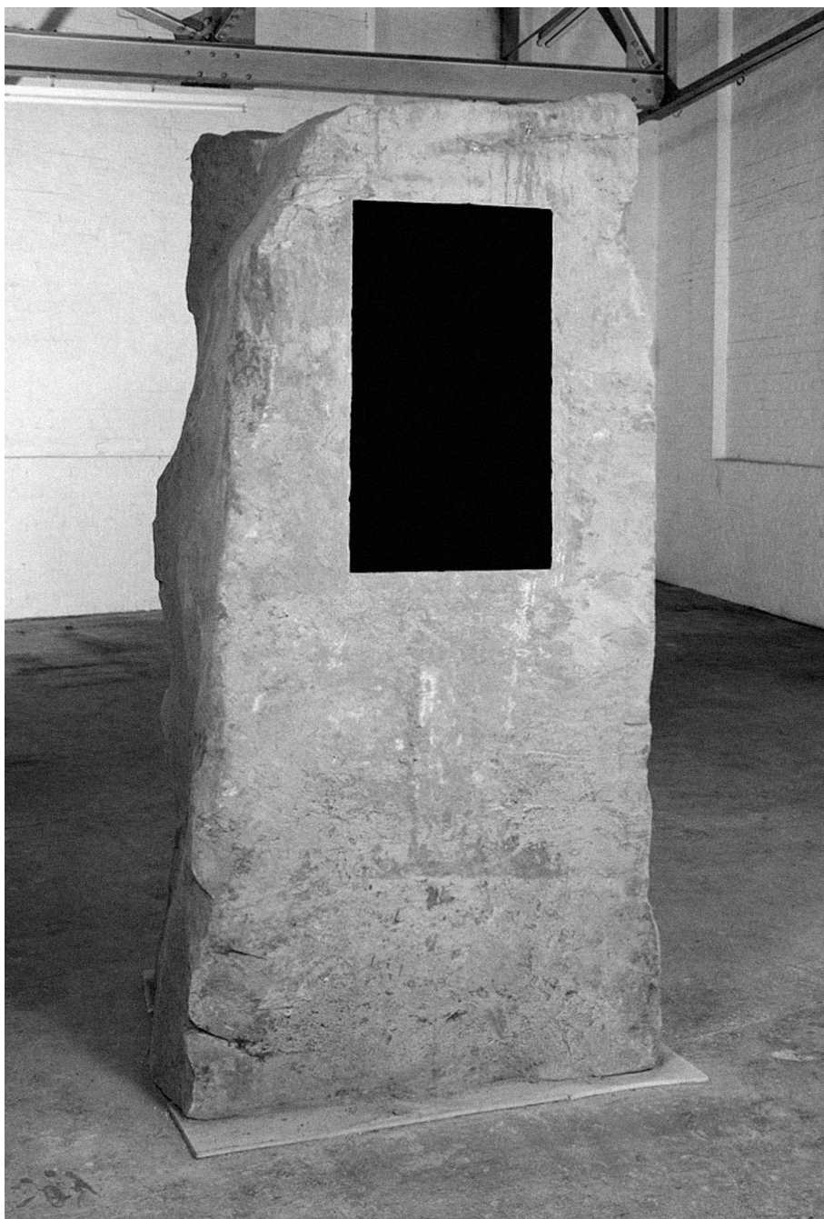
Anish Kapoor, Adam , 1988–1989