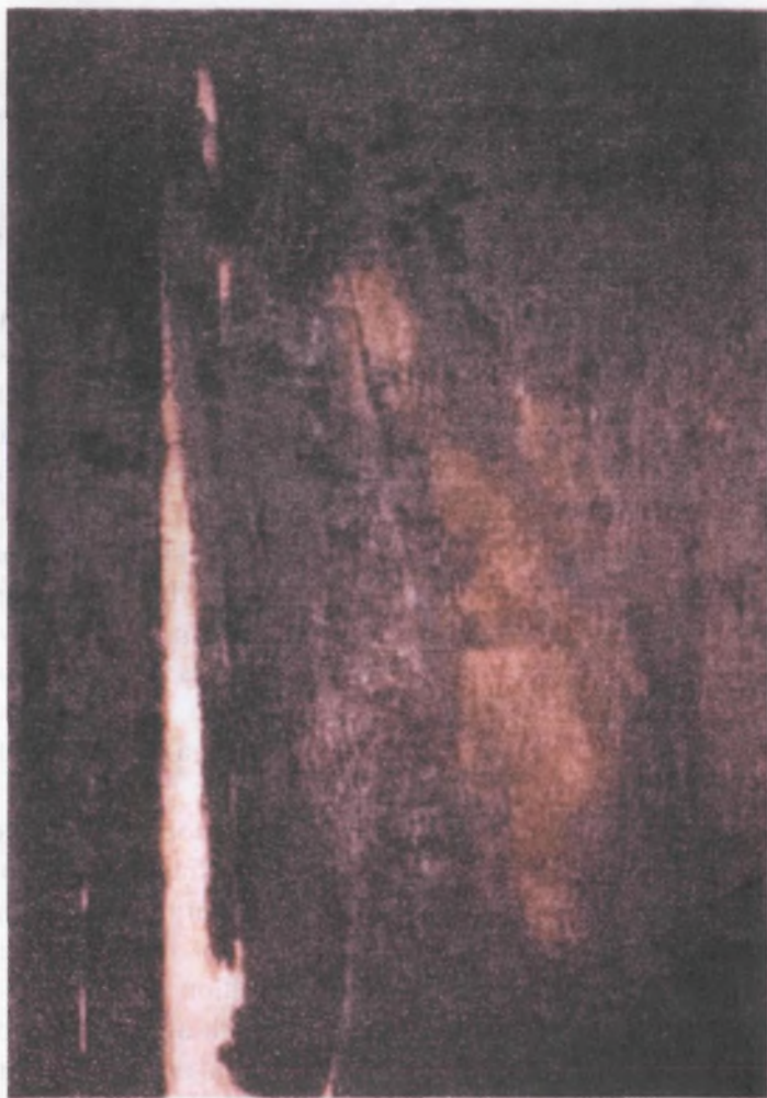
Plate 1, Black Crack , 1963, 140 x 140 cm, oil on canvas