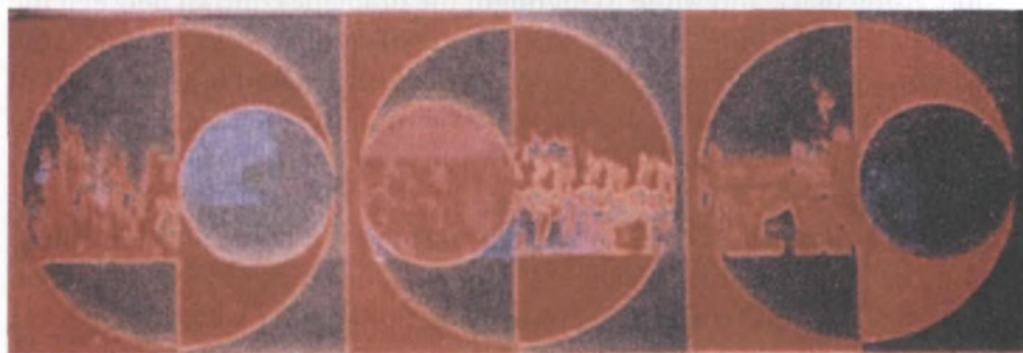
Plate 2, Bath of Fire , 1968, 132 x 132 x 3 cm, oil, acrylic and serigraphy on canvas