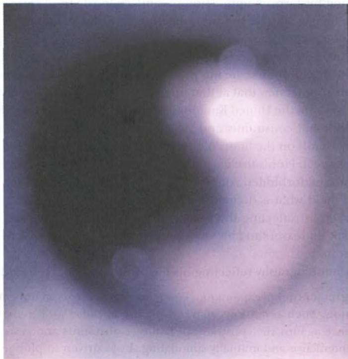
Plate 3, The Way of Lotus 1974, 132 x 132 cm, acrylic on canvas

After finishing Bath of Fire in 1968, Hon traveled to Europe and the United States. When he got back to Hong Kong, he simplified his work considerably. His paintings were almost without line, shape, form, or even color: as examples, Karma Focus (1971) or The Way of Lotus (Plate 3, 1974). For these paintings, Hon obviously employed – instead of the brush – more modern materials, like a spray gun. The spaces he illustrated were neither defined nor abstract, but were somewhat serene, with a detached aura and harmony. Critics said that in the 70s and 80s, Hon rejected the use of forms. He reduced objective images to their purest forms, to the circle, for instance. His personal style expressed his interior world as well as his feeling and understanding of nature and the universe.