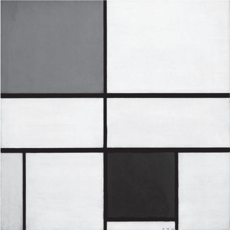
Figure 2: Piet Mondrian, Composition C (no. III), with Red, Yellow and Blue , 1935, Oil on canvas, 56,2 x 55,1 cm; private collection (on loan to Tate Gallery London, 2012).

and limitation—the creative factors of space—through neutral forms, free lines and pure colors. While universal reality arises from determinate relations, particular reality shows only veiled relations. The latter must obviously be confused in just that respect in which universal reality is bound to be clear. 6