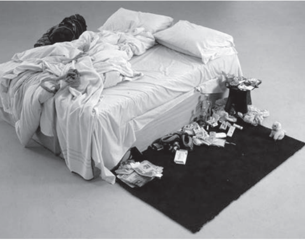
Figure 4: Tracey Emin, My Bed , 1998, installation; exhibited at the Tate Gallery in 1999 as one of the shortlisted works for the Turner Prize.

in the poetical or rhetorical direction. In brief: within the scope of a doubtful analogy, indexically used objects can always be interpreted in different ways in art. And since reflection and analytical work in this respect is no longer based on a specific aesthetic manner of perception that differs essentially from the functional one, but rather on functional identification, the two of them change profoundly. Late modernism is no longer familiar with aesthetic perception and experiencing in the narrow sense of the word, but has, on the basis of modern technical and functional perceptions, developed new methods of perception, reflection and analysis; particularly those of functional, cognitive, contextual and social-critical provenance ( Figure 4 ). 21