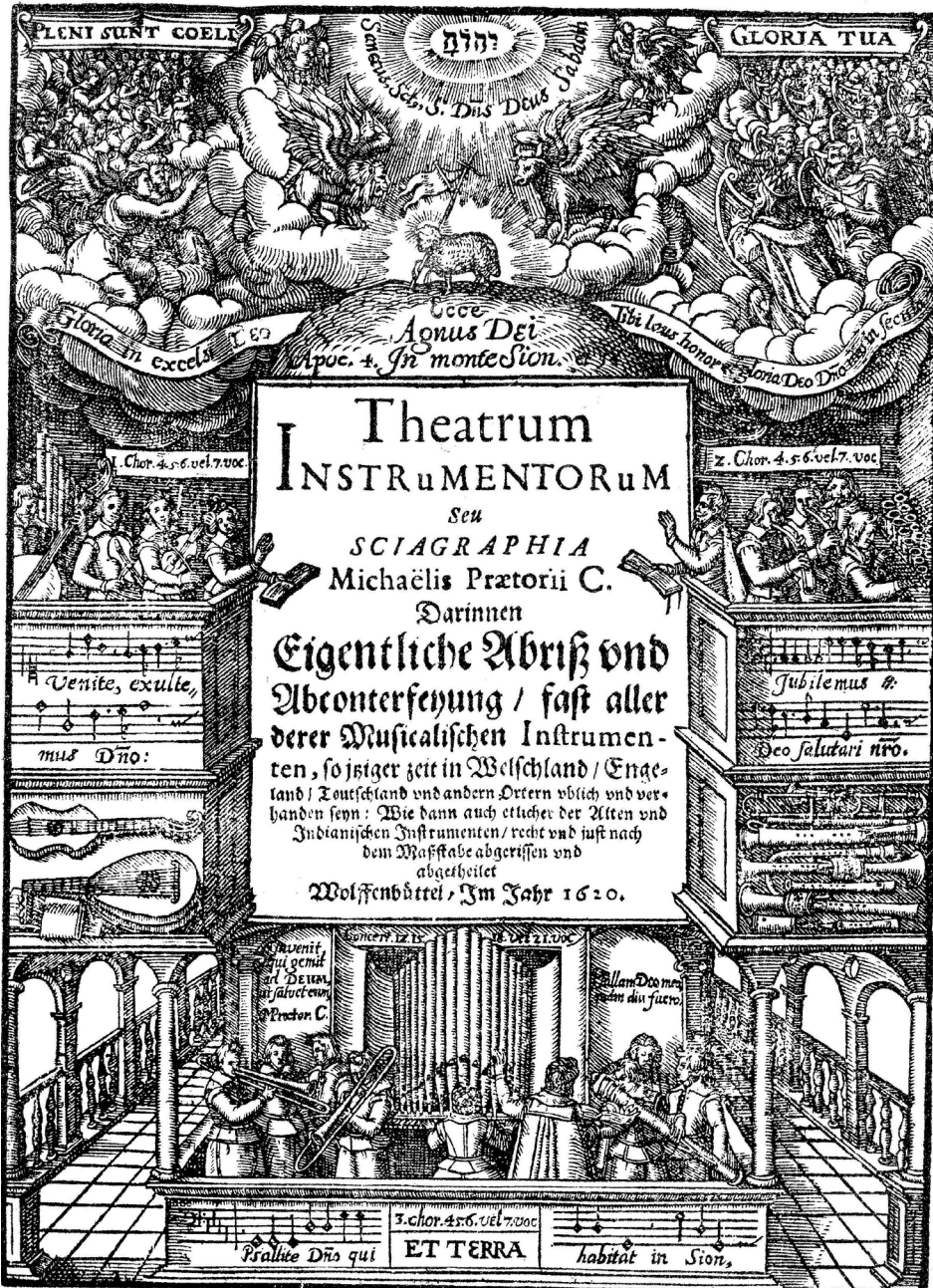
Figure 1 The title page of Michael Praetorius, Theatrum instrumentorum , Wolfenbüttel, 1620. (Public domain.)