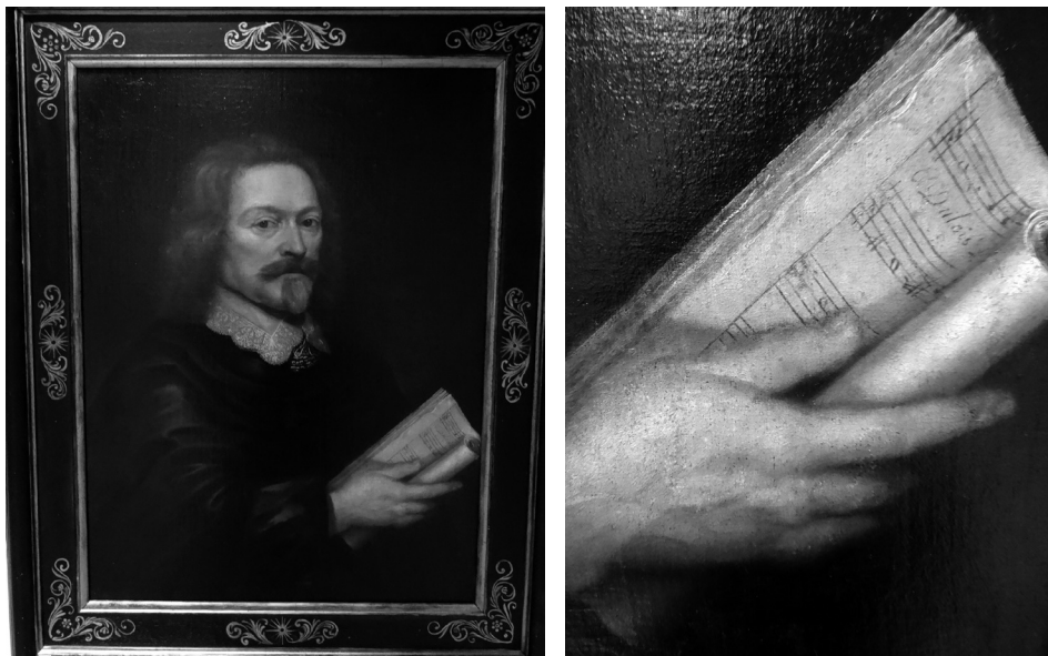
Figures 7 and 7a

Anonymous portrait of a musician, probably Nicholas Lanier (c. 1645), and detail.