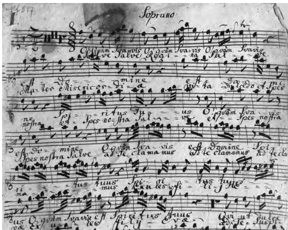
Figure 3 “O quam suavis est, Domine” / “Salve Regina” (Warsaw, Biblioteka Uniwersytecka, RM 4457/22; reproduced with kind permission).

As proof that the observed travestimento spirituale process was not accidental, we have a specific group of manuscripts from Hancke’s collections in which the arrangements contain a harp part not present in the original, and which exhibit exactly the same stages of the phenomenon reconstructed above.