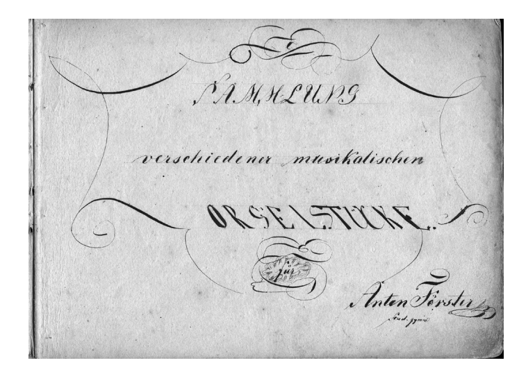
Figure 1 Sammlung – title page.