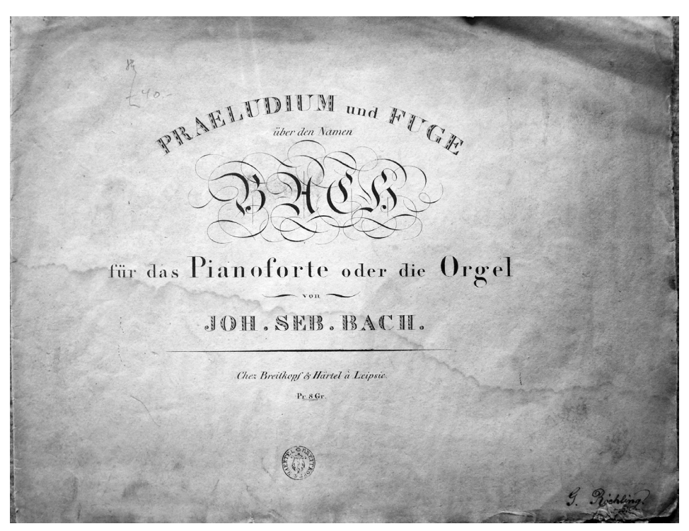
Figure 6 First edition of BWV 898, title page.

The title page (see Figure 2), on which traces of original pencil lines can be discerned only under the title of the first piece, confirms that the two works were not copied in close succession. The two titles also appear to be in different handwritings, as evident in the word "Fuge" and Bach's name. For reasons that remain unclear, the title of BWV 898 on the title page and the initial set of clefs with the key and time signatures are in the hand of scribe B. The original text below the mark of ownership "A. M. Förster", which may have been the name of the previous owner or of the person who commenced the copying, appears to have been scratched out. The initial "A" may originally have been the letter "J". The note of the price on the manuscript probably reads "30 Xr" ( Kreuzer ). Since there is no known edition with a price stated in Kreuzer from which the title page could have been copied, we must assume that either the manuscript was originally intended for sale (which never materialised), or that it was copied from another manuscript sold at that price.