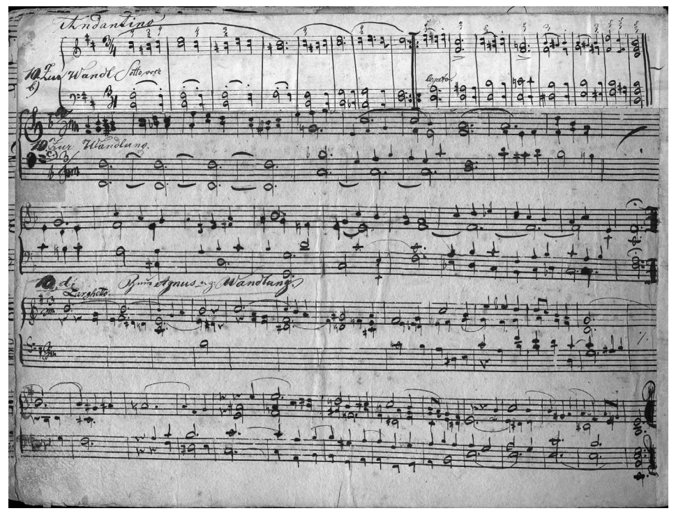
Figure 4 Anton Foerster's early handwriting, f. 8° (National and University Library, Ljubljana, Music Collection, 2866/1955; with permission).

gained much experience in copying music. The pieces numbered 10b-d, also added by him, remain unidentified.