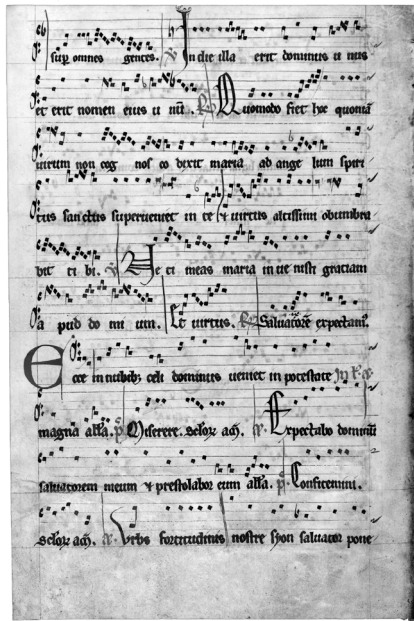
Figures 7 and 8

Folios 2r and 2v from Manuscript 273 (Graz University Library; with permission).