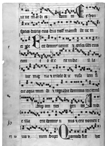
Figures 9 and 10

Folios 10r and 10v from Manuscript 7 (Graz University Library; with permission).