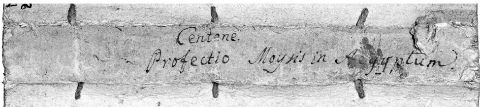
Figure 2 Profectio Moysis in Aegyptum , spine.

The spine of the same manuscript, reproduced as Figure 2, includes similar information, albeit without mention of the oratorio’s alleged Neapolitan origin. Its word “centone”, indeed, directly translates into ‘patchwork’, ‘pasticcio’.