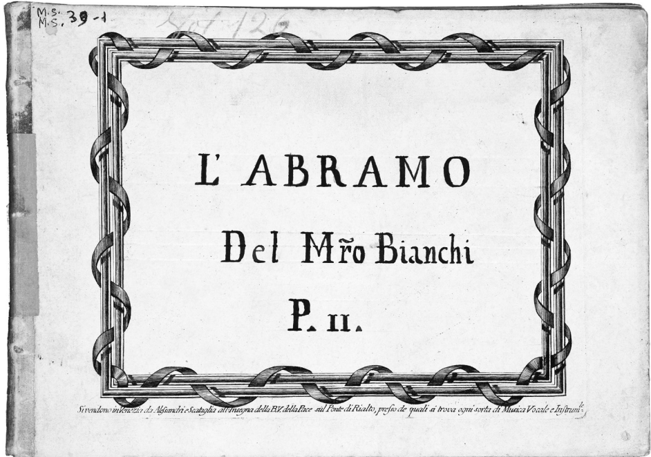
Figure 4 Francesco Bianchi, Abramo , cover of Part II (I-Mc, M.S. MS. 39-1).