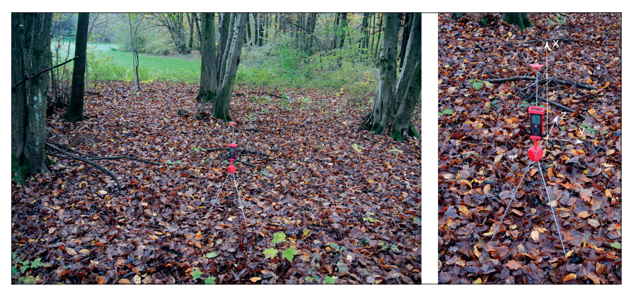
Fig. 1: DistoX on the calibration tool in the field work location. The coordinate system is defined as in Heeb (2009).

According to Heeb (2009), 4 evenly spread out unidirectional groups of 4 shots at different roll angles, combined with free measurements, are enough to determine the calibration coefficients with a good precision. More groups increase the precision; so, 14 unidirectional