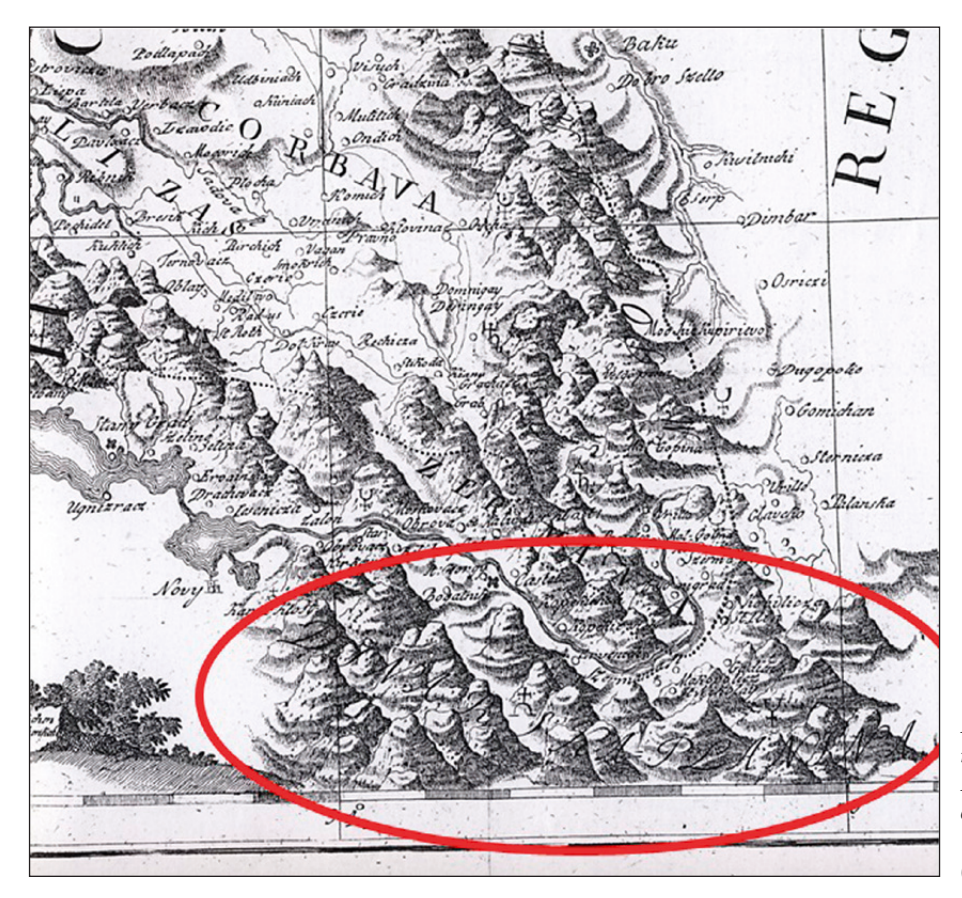
Fig. 3: Extract of the Hacquet's map "Continuatio Mappae Litho Hydrographicae Nationis Slavicae" (1787) where the inscription "Dinarska Planina" is well seen (Hacquet 1789).

traced. They have to be mapped and the first of maps is the set "Mappa geographico limitanea ..." kept in the War Archives (Kriegsarchiv) in Vienna. The most important