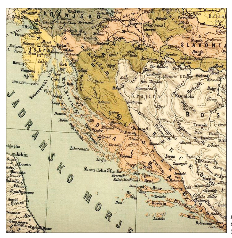
Fig. 4: The map of Balkans from the first Slovenian atlas, the Atlant (1869).

der towns of Zadar and Šibenik..." he mentioned "The River Cetina...which have springs on the Eastern and Southern sides of the Mountain Dinara" (Evlija 1996). We are sorry to say that we could not consult the original in Turkish language to see how the name Dinara is written. It can be in some other form and as the translator knew it is Dinara, he wrote the actual name. In fact, Evliya's orthography of geographical names is different from actual one, probably he had difficulties to write down unusual (for the