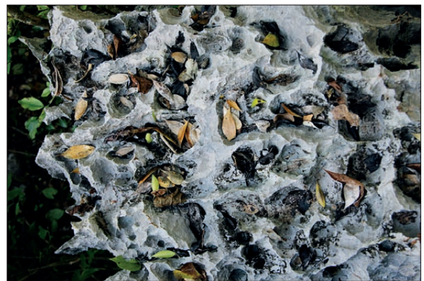
Fig. 9: Subsoil cups.

Wall channels (Fig. 3h) also form below subsoil channels, subsoil cups, or funnel-like notches at edges. Water flows from them and trickles down the walls. Flutes that tend to be deeper than simple rain flutes also form below the tops of ridges that until recently have been covered by weathered debris from which water oozed evenly to their bottoms. The tops therefore have flat and smooth surfaces. They are co-formed by rainwater and water flowing from weathered debris. However, they could also be considered of subsoil origin since it appears they began to form when the entire rock ridges were covered by weathered debris.