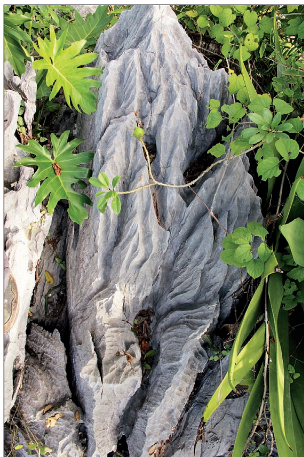
Fig. 6: Rain flutes and subsoil channels and cups.

the channels below them have often been reshaped under soil with cross-sections resembling an upside down omega letter, which as a rule applies to the largest (Fig. 6). Their diameters range from one to ten centimeters. The walls of the funnel-shaped notches dissecting the tops of the rock and the more gently inclined channels that were filled with weathered debris are often dissected by subsoil flutes. The water crept evenly down the entire surface under the moist weathered debris. Subsoil forms completely dominate on the tops where vegetation grows. This is a unique system of subsoil channels and flutes.