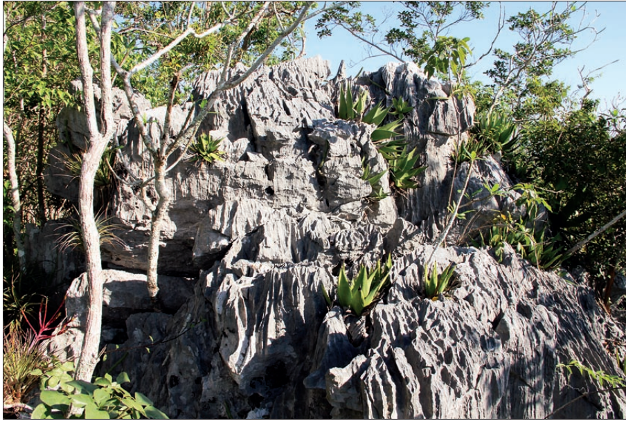
Fig. 7: Rain flutes, channels, funnel-shaped notches, subsoil cups.