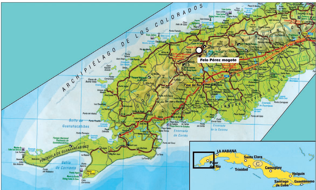
Fig. 2: The location of Felo Pérez mogote.