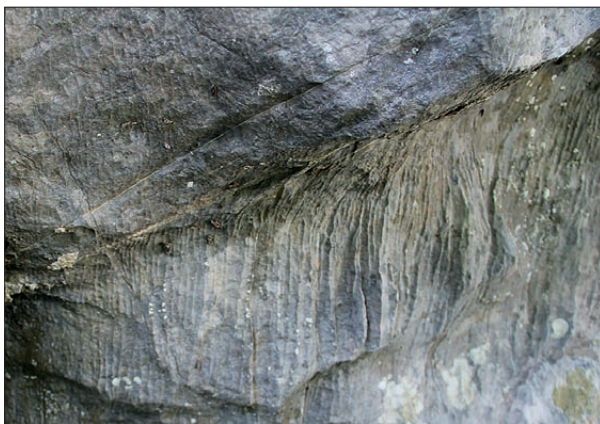
Fig. 8: Flutes, shaped by trickling water.