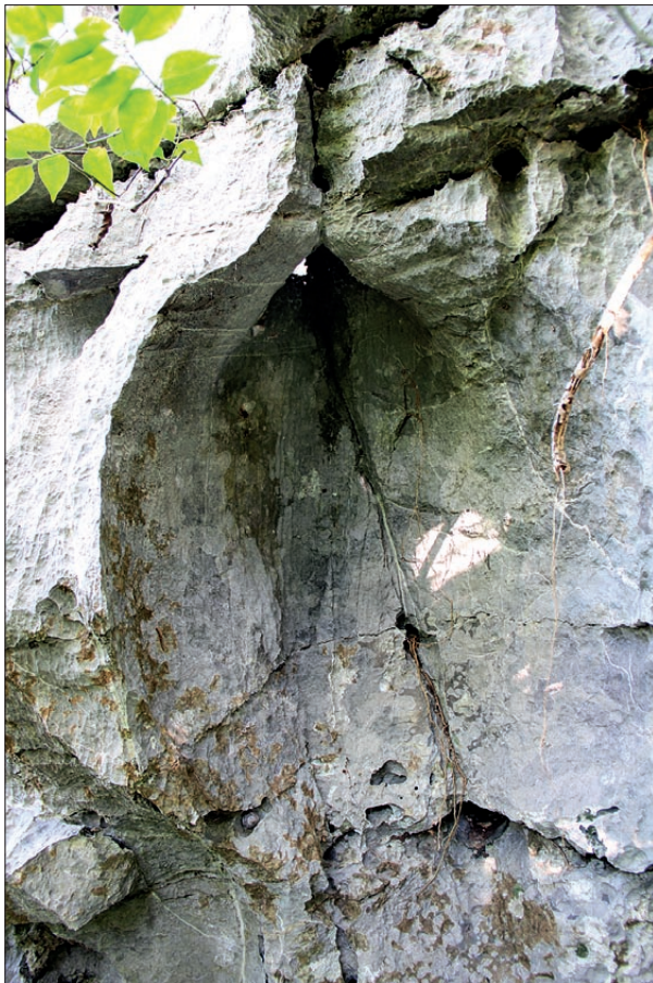
Fig. 4: Half-bell reshaped by creeping water.

as a rule, were shaped by water percolating from the surface that deepened their bottoms. The mouths of smaller hollows and shafts display funnel-like widenings and larger hollows end in pocket-like niches. On the walls, especially in the lower sections above the sediment surrounding the mogote, there are subsoil channels whose diameters reach 0.75 meter. Water creeping evenly over the entire surface along the contact with sediment creates subsoil scallops, some with pocket-like deepenings. Subsoil notches (Fig. 3b) form along the long-term level of sediment surrounding the rock. Their diameter can exceed one meter; at the bottom they are often open and in places, especially along vertical fissures or along in-