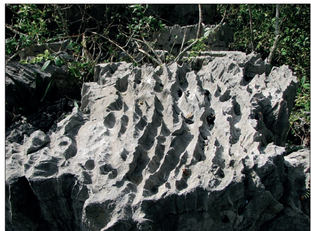
Fig. 5: Subsoil channels.

The tops and upper parts of the slopes are completely dominated by rock forms that are the trace of water creeping down the inclined surface under the soil and weathered debris which covers the rock in places or on the denuded rock. After the denudation of this part of the mogote's surface, further overgrowing did not occur or was quite rare. Rainwater began to reshape the rock and dissect it with flutes and channels. Later multiple periods of overgrowing fostered the deposit of plant remains on the more gently sloping or lower sections of the rock, which only then started to dissect under the weathered debris. Subsoil channels and flutes formed (Fig. 5). Their