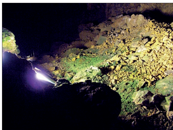
Fig. 5: Clastic deposits and clay promote the growth of large patches of mosses.

and ferns, which usually appear in later stages (Mulec & Kubešová 2010). Near various LED lamps installed along the steps of the downwards pathway, green patches of microalgae were found, but near some LEDs small, very scattered individuals of Bryum sp., Eucladium verticillatum , Fissidens bryoides , Oxyrrhynchium schleicheri , sometimes accompanied by single small shoots of Asplenium trichomanes were observed, extending up to a distance of 15 cm from the lights (Tab. 2, Fig. 3). In the artificial tunnel along the Carlo Finocchiaro path, opened to the public in 1996, lampenflora is colonizing the moist calcareous walls around almost all the fluorescent lamps, with Bryum sp., Didymodon vinealis , Eucladium verticillatum , Fissidens bryoides , Oxyrrhynchium schleicheri ,