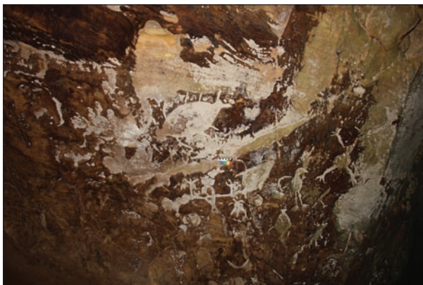
Fig. 2: Overall view of the first panel in the second entrance to the Caverna das Mãos . Notice the 10 cm IFRAO scale in the center. Twilight zone.

Through the other entrance to the cave, following a small stream for about 350 meters, it is possible to identify cave paintings with hands as positive forms on the walls. The importance of the cave, besides its geological features and the collection of paintings itself, is enhanced by the fact that the images were painted in aphotic zone, with no natural light, at all. One can