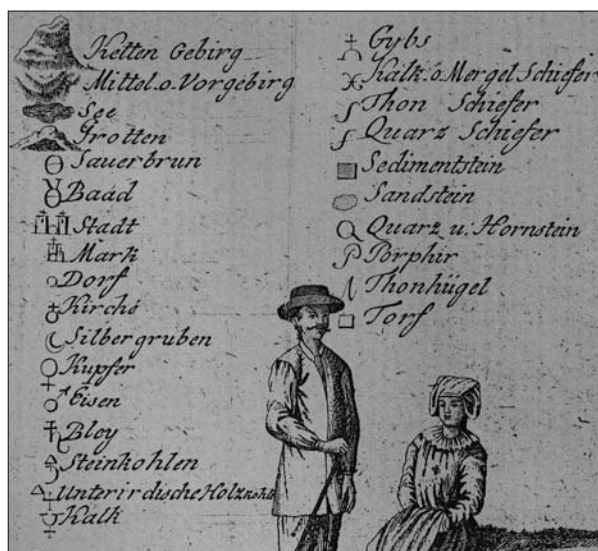
Fig. 2. Cutting out of the legend to Hacquet’s Mappa Litho Hydrographica Nationis slavicae (Hacquet 1778 – 1789).