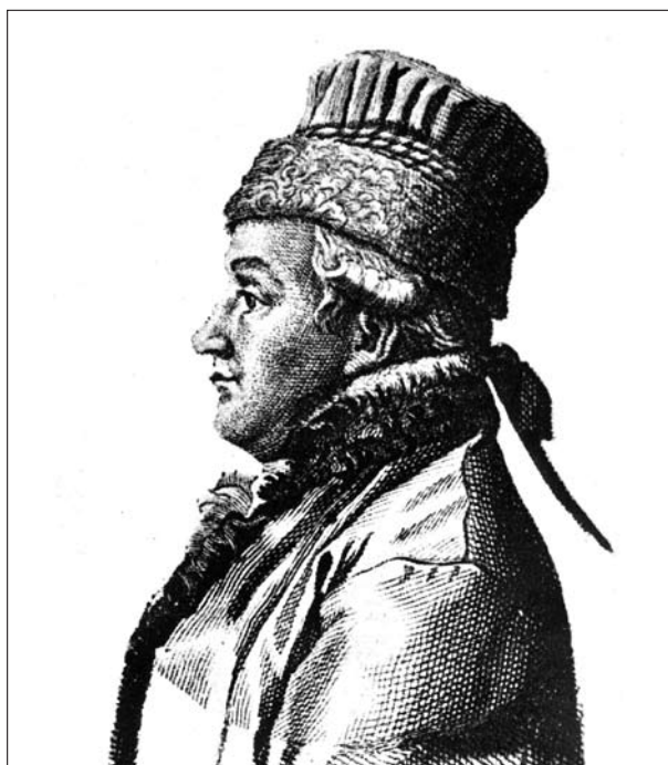
Fig. 1. Baltazar Hacquet (Ilustrirani Slovenec 1927).