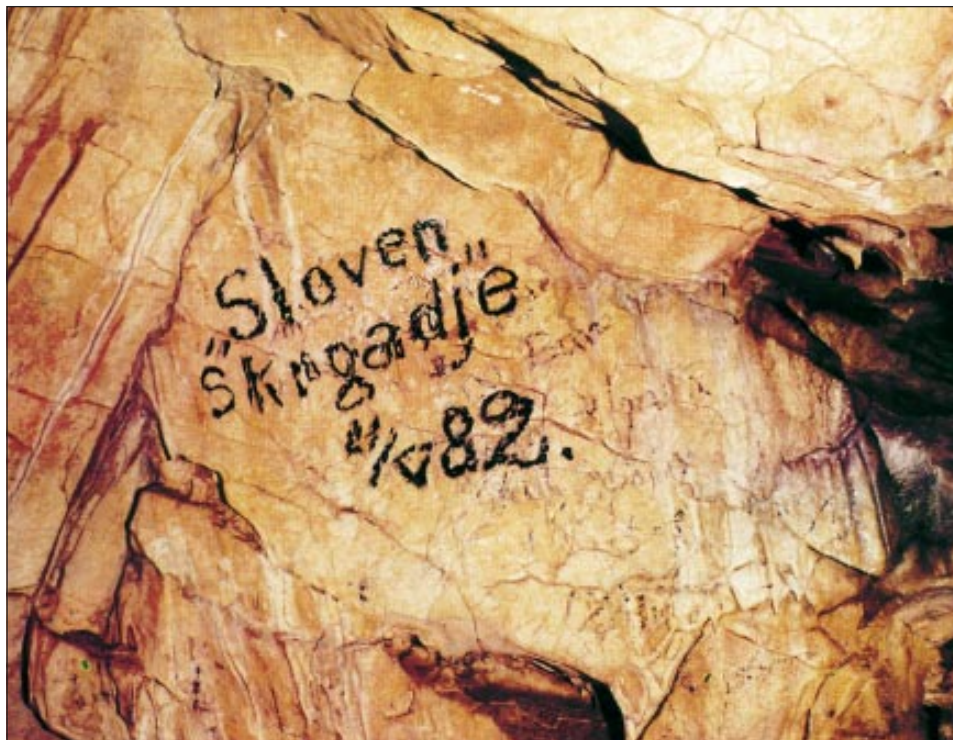
Fig. 1: The inscription "Slovenski gadje 21/V 82" at the end of Stara jama passage in Jama near Predjama (at that time it was the dead end of the cave).

In Postojnska jama most of new passages were discovered and explored soon after Čeč's achievement in 1818 and later in the middle of the century when a group of explorers, led by Schmidl, succeeded to overcome the entrance shaft into Pivka jama. The Archives of Postojnska jama do not bear any special notion that the Cave Management Commission was particularly interested in cave exploration and discovery of new passages; the reason may be that at the