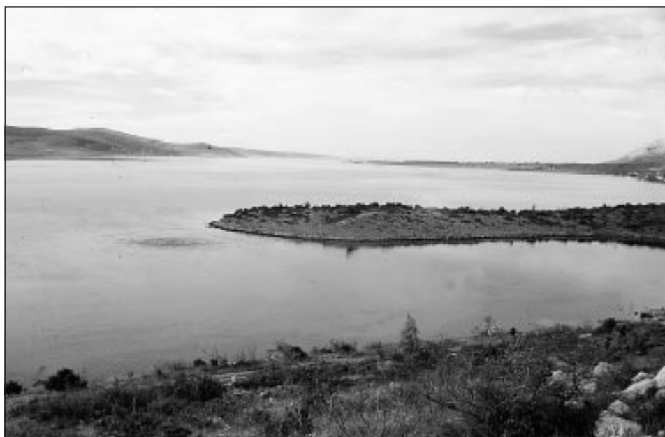
Fig. 2: Submarine spring Vrulja Zečica near Starigrad (Photo by D. Petricioli).

Corrosional processes of karstification undoubtedly cease by the sea water flooding, but the erosion can go on even under the sea, precisely through the major channels of the submarine springs with abundant discharge. An example is vrulja Zečica under Mt Velebit (Fig. 2) in which pebbles and cobbles originating from Mt Velebit can be found (Bakran-Petricioli & Petricioli, 1999).