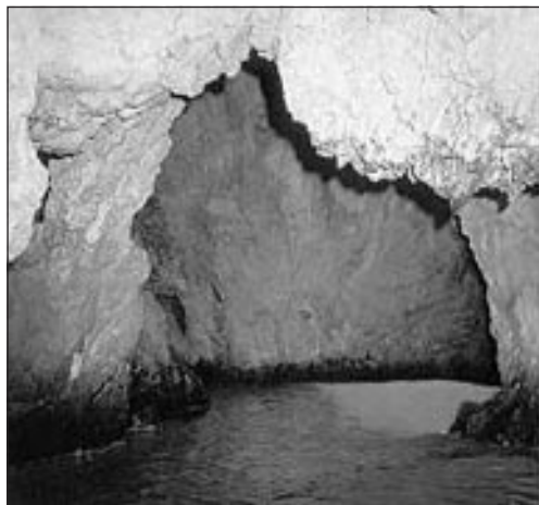
Fig. 5: Partly submerged cave Modra spilja (Blue Cave) on Biševo Island.

of immediate submerging of the speleothem by the rising sea, dating of speleothems from vertical objects on steep terrains also provided acceptable results. Namely, on steep terrains (present sea bottom), the bedrock between the rising sea and the pit was not so thick as to prevent sufficient sea water intrusion and establishment of the marine environment inside the objects, such as on the flatten terrains. In the Cave in Tihovac Bay (Pag Island), marine conditions with colonies of organisms belonging to characteristic biocenosis of completely dark caves and passages, at the depth of 23 m, were probably established 8300 years ago when the distance between the cave and open sea was approximately 160 m. In the Pit in Lučice Bay (Brač Island), at depths of 36 and 34 m such conditions were established c. 10500 and 9100 y BP respectively, when the open sea was less than 170 m far from the pit (Surić 2002).