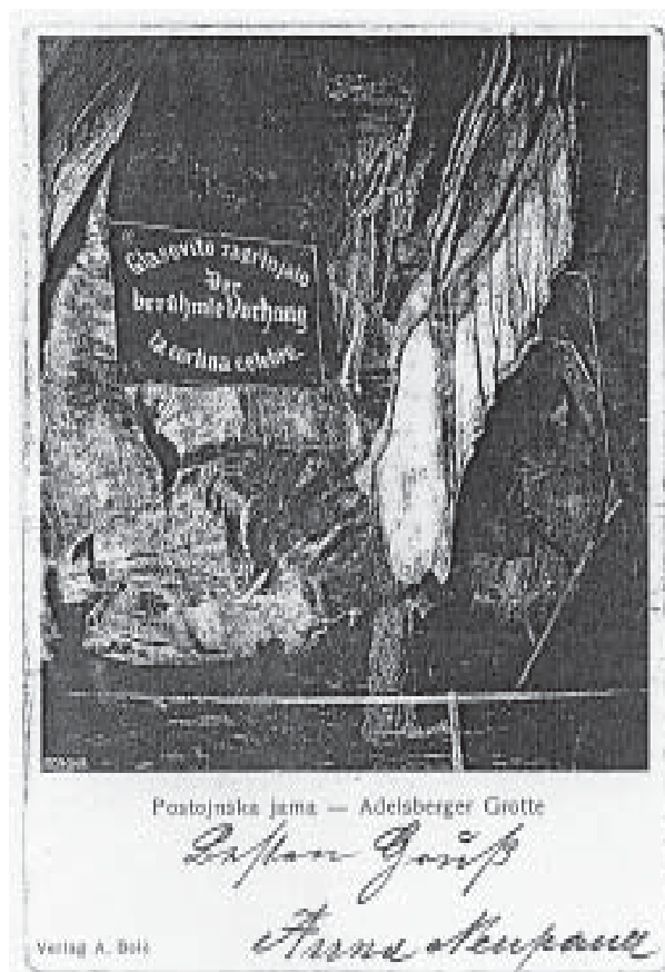
Fig. 4: The Vorhang (curtain) in the 1890s, with a typical name board used at that time.

The first half of the document, listing the places to have illuminated signs, is headed “Transparents – Aufschriften” (Name Transparencies) and the names are those of special groups of stalagmites, etc., such as are given imaginative names in all caves shown to the public. Much of this document is specially difficult to read and the places names have been confirmed by comparison with those on Eumike’s 1858 plan (in Costa 1858). In Appendix III the original German names have therefore been transcribed, together with literal translations into English and the Slovene names given in the near-contemporary Slovene translation of Eumike’s 1858 plan (in Costa 1863), as well as the present-day Slovene names where these are known to be different.