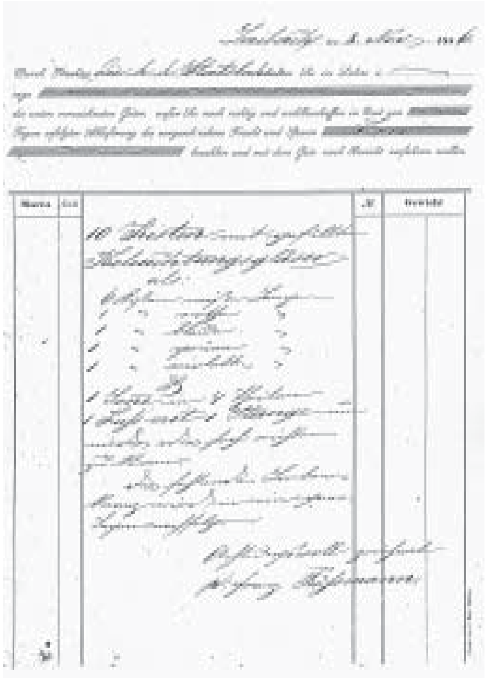
Fig. 1: Delivery Note dated 8 November 1856 (archives of Postojnska jama).