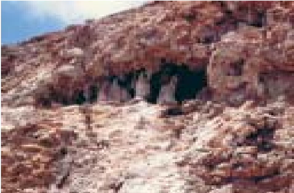
Photo 1: Stalactites and stalagmites in travertine at Ciklos site northern flank of the Kyrenia Range.