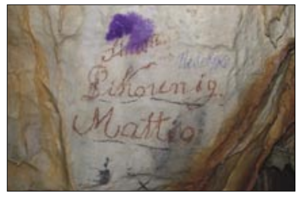
Fig. 11: A dark red chalk inscription on the W-wall shortly before survey station XII.