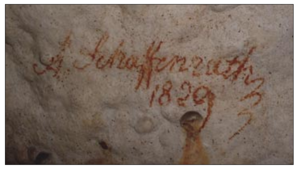
Fig. 6: Schaffenrath's signature in dark red chalk left in 1829 in the old cave.

S. Kempe & I. Bauer & H. Dirks & H.-V. Henschel: Schaffenrath's Inscription Column in Pisani rov, Postojnska jama