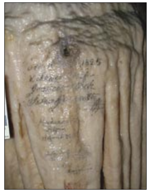
Fig. 3: The main inscription panel with the candle peg on top.