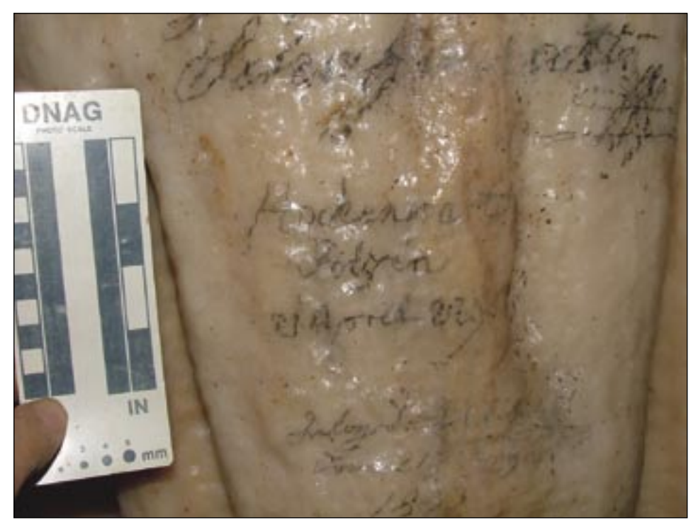
Fig. 7: Hohenwart's inscription on the column, dated 21 April 1829. Note that he spelled his name Hochenwart. Underneath there follows an illegible name with the date.