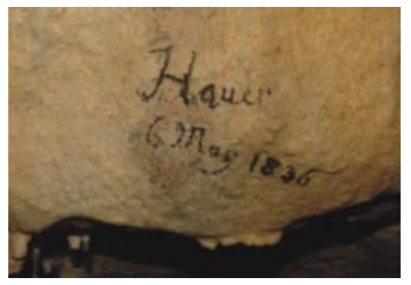
Fig. 12: The inscription of a certain "Hauer" near the same place as in Fig. 10.

side of the inscription is obliterated by a thin layer of flowstone. The digital pictures taken in macromode actually allow a much better view than seen by the unaided eye in the cave since the flash can penetrate the new flowstone to a certain extent. The inscription is written in Current script, the German handwriting used in parallel to the Latin letters. According to Harald Süß (pers. com.) - a specialist of Current script - the first name can be read as "Aloys". The "A" is a complex letter involving not only the "L" looking double curl but also the next smaller bulge. The end "s" is a flourish pointing upward as is usual in Current handwriting of the time. The following family name cannot be clearly read. A long curved underlining is however discernable. The name is followed by a date, of which we can read "den 21" (again written in Current script) and the year "1833". This is the year when a team of surveyors from Idria surveyed Postojnska jama. In the Tartarus the team, led by Johann Fercher, left their signature, dated February 7th, 1833. Among them was a certain Aloys Urbas. It is highly probable that it is also his name in Pisani rov. When looking at the pictures again, "Urbas" would fit with the pattern of lines discernable through the flowstone.