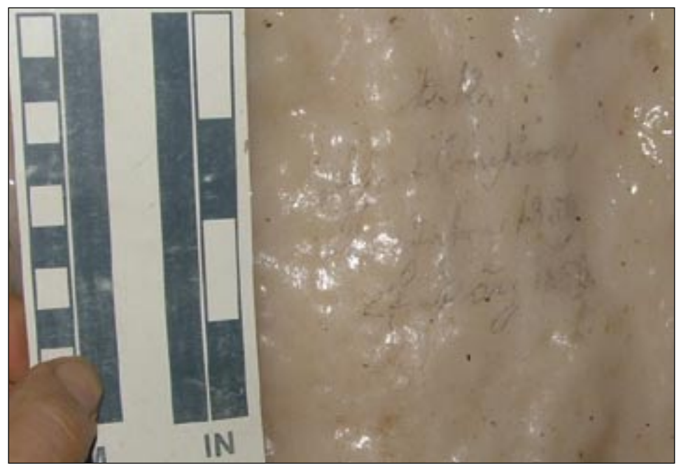
Fig. 8: The faint pencil inscription of a "k.k. Assent Commission", which visited the cave in spring 1859.