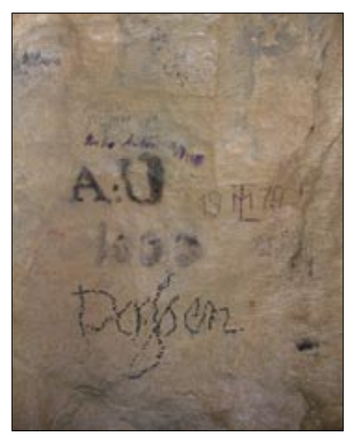
Fig. 9: The inscription panel above the path be tween survey stations XI and XII.

inscriptions made by himself; two are found in the Old Cave dated 1814 and 1817. According to the discussion of the early maps, it is well conceivable that the entrance to Pisani rov was discovered as late as 1825 and that the date could commemorate its first exploration.