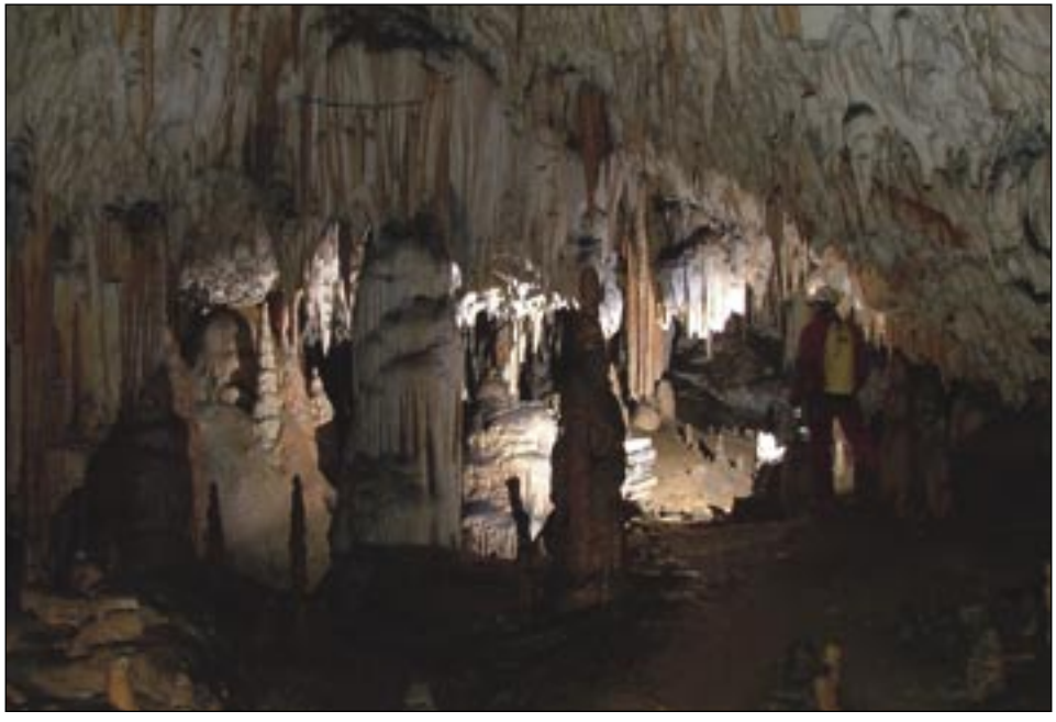
Fig. 1: View of Pisani rov 90 m from its entrance looking N. The inscription column is to the left.

S. Kempe & I. Bauer & H. Dirks & H.-V. Henschel: Schaffenrath's Inscription Column in Pisani rov, Postojnska jama