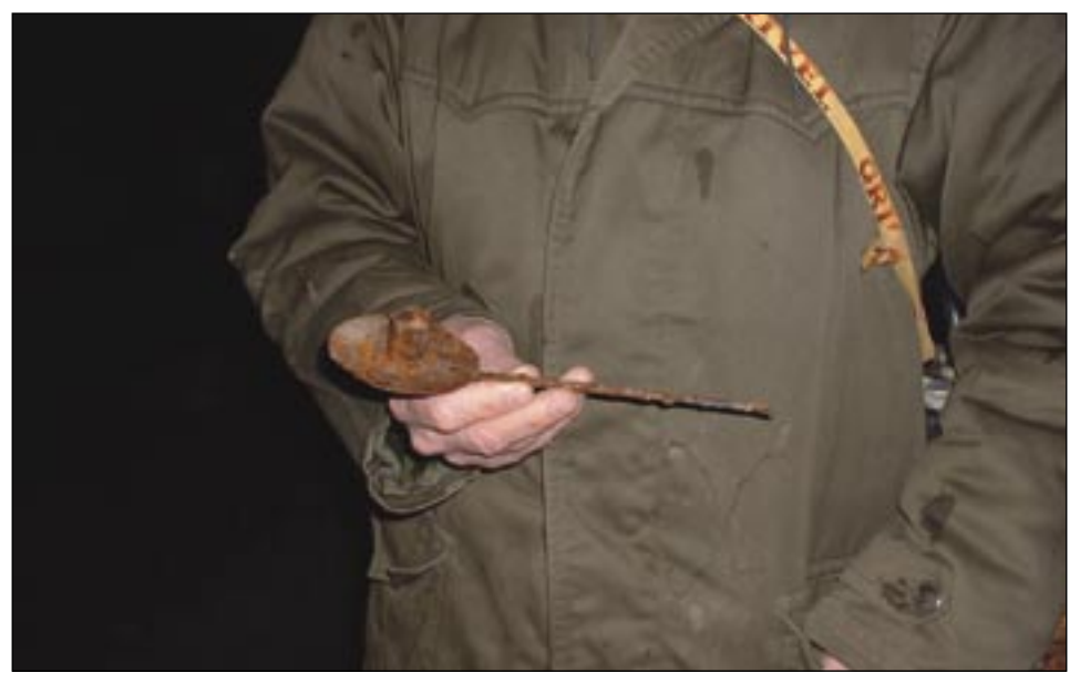
Fig. 4: A picture of one of the candle holders which used to be attached to the wooden pegs to hold candles for illumination in the early days of the show cave operation.