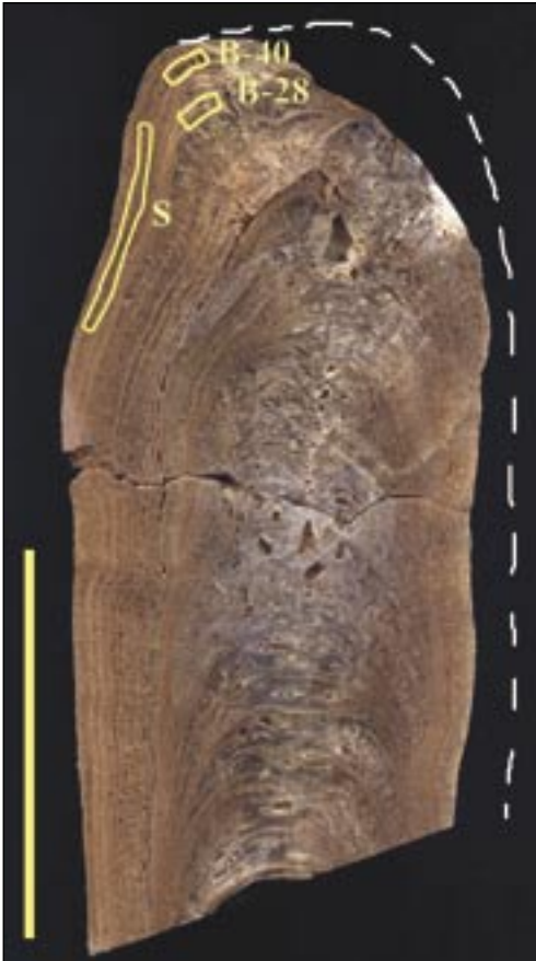
Fig. 4: Longitudinal section of stalagmite Z-41 with marked sampling sites (scale bar 10 cm). Reconstructed part oriented toward recent periodical fresh-water inflow destroyed by mechanical erosion.

Five samples were dated by ^{230}\text{Th}/^{234}\text{U} method using Multi Collector Inductively Coupled Plasma Mass Spectrometry (MC ICPMS) at the Isotope Geochemistry Laboratory and Mass Spectrometry Laboratory, University of Bristol. For each measurement ~300 mg of carbonate was separated, either in the form of powder (from stalagmite Z-41) or in the form of wafer (from stalactite P-23). After the separation of uranium and thorium in ion exchange columns, and plasma ionisation, their amounts were measured by mass spectrometry.