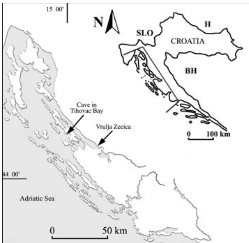
Fig. 1: Study area with sampling sites.

Regarding these facts, submerged speleothems have been studied in order to reconstruct eustatic (global) and relative (local/regional) sea-level changes worldwide (Li et al. 1989; Allesio et al. 1992; Richards et al. 1994; Antonioli et al. 2001; Vrhovec 2001; Bard et al. 2002; Surić 2002; Fornós et