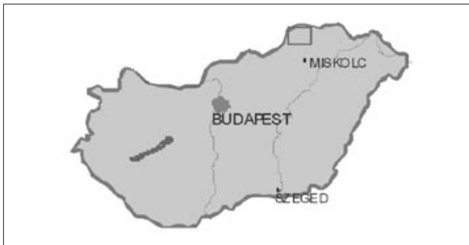
Map I. Map of Hungary.

The EDTA soluble metal content was determined after shaking with 0.02M EDTA solution ( \text{pH} = 4.65 \pm 0.05 ) and filtered it. (LAKANEN, E.- ERVIÖ, R. 1971) The manganese, iron, magnesium, calcium, potassium, aluminium content of the solutions which made from the greenery and the soils were determined by ICP-AES techniques, and the copper and zinc by FAAS techniques. The measurements took place in the University of Veszprém.