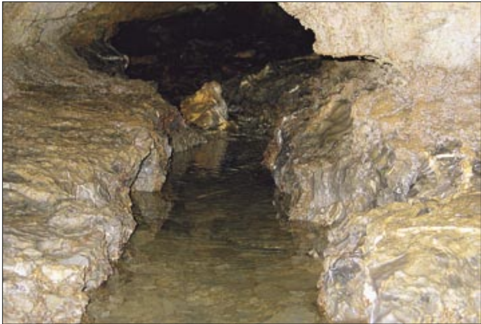
Figure 4: Passage developed in breccia.

On the territory around the cave, the green marls are included in breccias or breccias are included in green marls. Individual lithological members vertically and laterally uninterrupted pass one into another or their contacts are sharp. Clasts in coarse-grained breccia, in which the cave is located, vary from some cm to several dm in diameter. Clasts are deriving mostly from younger rudist limestones, Lower and Upper Cretaceous and Jurassic micritic and oolitic limestones. Sorting of clasts in breccia is not noticed. Breccia is massive and only rarely bedded. Smoganica is developed on the contact between upper limestone breccia and lower nonpermeable green marl. In the vicinity other similar spring caves are developed between breccia and marl. They are situated high on the steep slopes of Banjšice plateau.