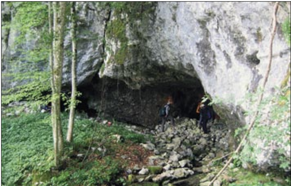
Figure 1: Entrance to Smoganica cave.

In Slovenia mightily prevail karst caves developed in limestone. In a smaller extent there are caves in dolomite, conglomerates and breccias. This is why the origin and development of Smoganica in the Upper Cretaceous breccia within the flysch rocks is so interesting.