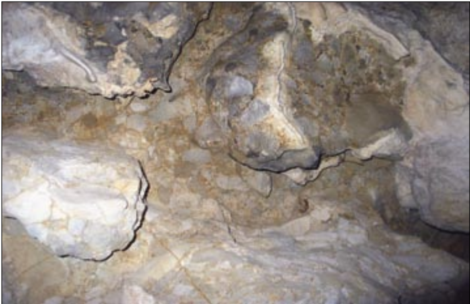
Figure 6: The above-sediment rock forms on the ceiling. Slika 6: Nadnaplavinske skalne oblike na stropu.

In the W part of the cave the cross Dinaric fissures (NE-SW) are cut by Dinaric (NW-SE) ori-