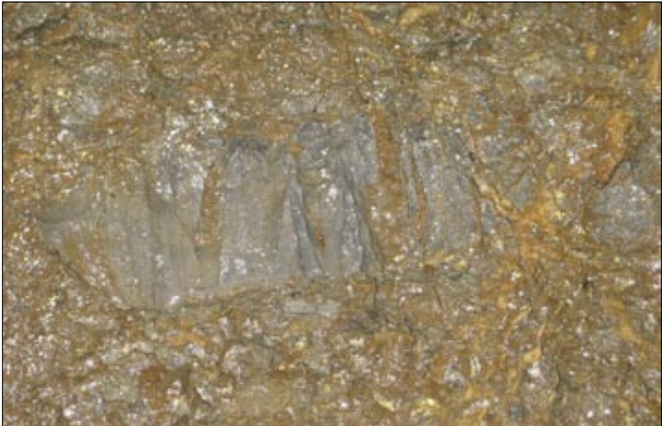
Figure 8: Flutes and channels are formed on bigger limestone clasts. Slika 8: Žlebovi in kanali so se oblikovali na apnenčastih klastih.

The next stage is reshaping of cave passages with actual water flow. Water is cutting floor channels into the breccia (Figure 4) and marl. Occasional stronger stream is making scallops and potholes (Figure 7). In breccia of Smoganica the scallops are formed only on the clasts of limestone bigger than 20 cm. The scallops are 5 cm long and have irregular shapes. Scallops (7 cm long and