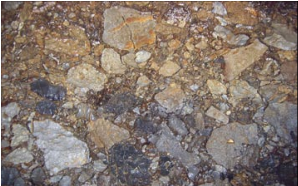
Figure 3: Maastrichtian breccia contains Cretaceous and Jurassic clasts having from some cm to some dm in diameter.

Marl layers are of various thicknesses, from one to several metres. Where the layers are thinner a gradual transition from breccia to marl is seen. In marl there are often pieces of limestone. The marl