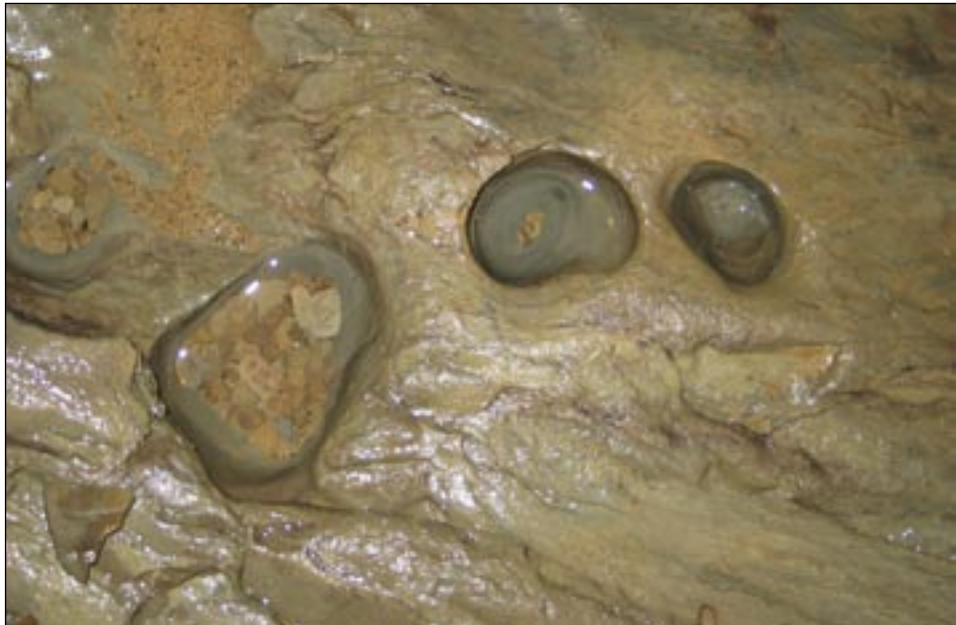
Figure 7: Potholes.

The cross Dinaric fault that runs through the valley of the Soča river (Figure 5) was determined by Poljak (2000).