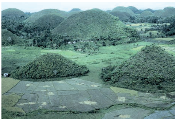
Fig. 4: The Chocolate Hills of Bohol

Conical karst hills, which are aptly called Chocolate Hills, are the most dominant feature of the karst landscape of central Bohol (Fig. 4). The Chocolate Hills Nat-