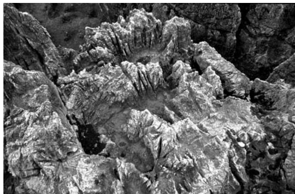
Figure 7: The top of stone pillar carved by rainfall.

These types of rock formations, especially the smallest flutes and cups, do not occur on this type of rock. The exceptions are the more limited highest zones of the stone forest, where the tooth tops are created in the dolomitic limestone of the E beds. Segmentation of most of the tops is therefore defined by the composition and diversification of the rock (Fig. 7). Rock exposed to rainfall is coarse