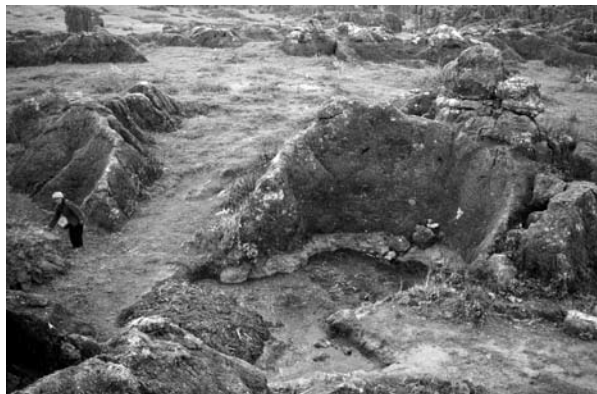
Figure 6: Subcutaneously shaped stone teeth.

Sequence C is 4 m thick. Here the rock is mostly limestone with no more than 10% dolomite crystals. The boundary between sequences B and C is sharp and immediately