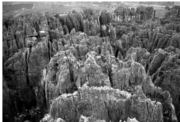
Figure 2: Lao Hei Gin stone forest. Top view.

The Lao Hei Gin stone forest (Figs. 1, 2, 3) lies 20 km north of Major Stone Forest. Individual stone pillars and larger rock blocks shaped by corrosion and erosion cover only about 2 km 2 . Morphologically the stone pillars are similar to those in the Naigu stone forest.