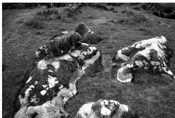
Figure 8: Dolomitic-limestone stone teeth.

At the highest section of the stone forest we find dolomitic limestone on the pillar tops, with flutes carved in them (Fig. 8). Smaller channels of a diameter of 1–2 cm