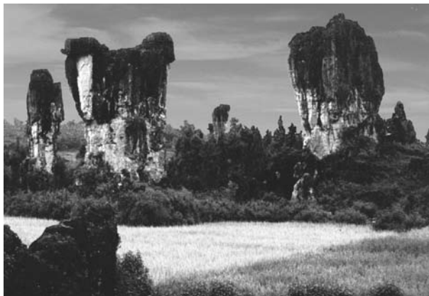
Figure 4: Single mushroom-like stone pillars.

Slika 4: Posamezni kamniti stebri gobastih oblik.