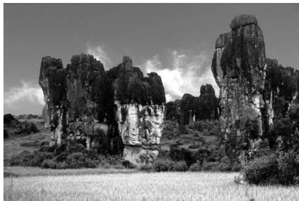
Figure 1: Lao Hei Gin stone forest.

2002). In this article we are adding the results of our exploration of yet another stone forest, unique in its formation.