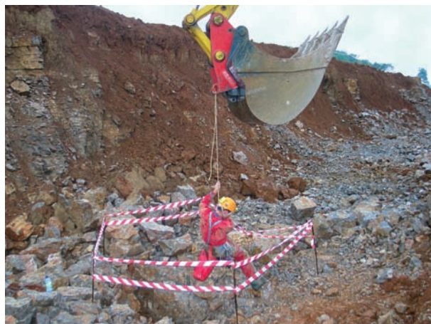
Fig. 8: Discovering of shaft.