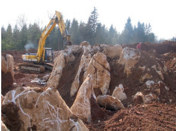
Fig. 5: Pointed tops of narrower pillars.

The subsoil stone forests are composed of a dense network of more or less thickset and pointed pillars, which reach up to 8, sometimes even 10 metres, although most are lower. The narrower pillars with a diameter of one to two metres have sharp or rounded spire (Fig. 5), while the thickest ones reaching up to ten metres (Fig. 6)