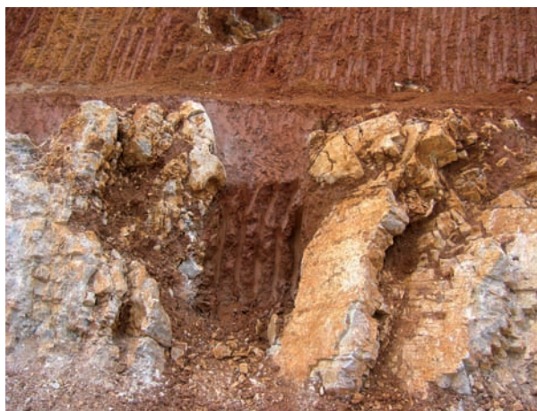
Fig. 11: Subsoil shaft along fault.

Subsoil shafts are more or less vertical hollows, similar to ordinary shafts, through which water also percolates from the karst surface, but they are almost entirely filled with sediment, with only individual vertical sections