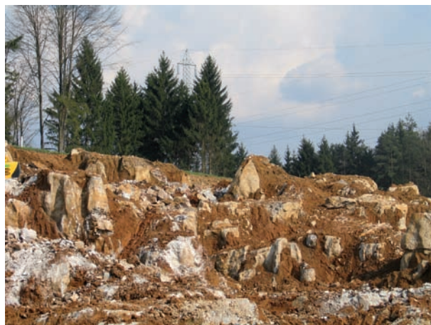
Fig. 1: Uncovering of subsoil stone forest.

Sl. 1: Razkrivanje podtalnega kamitega gozda.