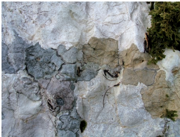
Fig. 3: Bio-corrosively etched surface of karren.

The major part of the forest-covered surface was dissected mainly by individual rocks of various sizes with partially similar traces of formation to the karren described above. They are frequently defined by fun-