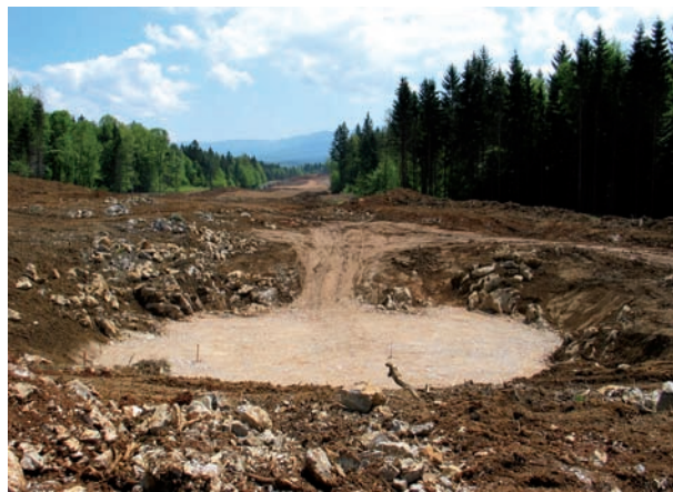
Fig. 4: Filling of dolina with gravel.

The configuration of the surface includes smaller or larger dolinas (Fig. 4). The largest have a diameter of several tens of metres. Some are filled with grey clay, the