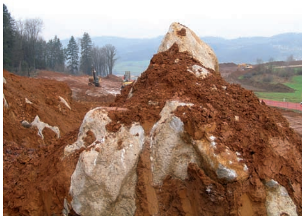
Fig. 2: Subsoil shaped pillar of stone forest.

Sl. 1: Razkrivanje podtalnega kamitega gozda.