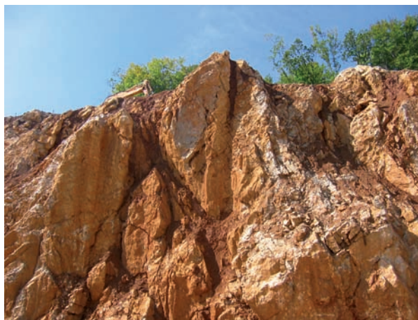
Fig. 7: Subsoil channels.