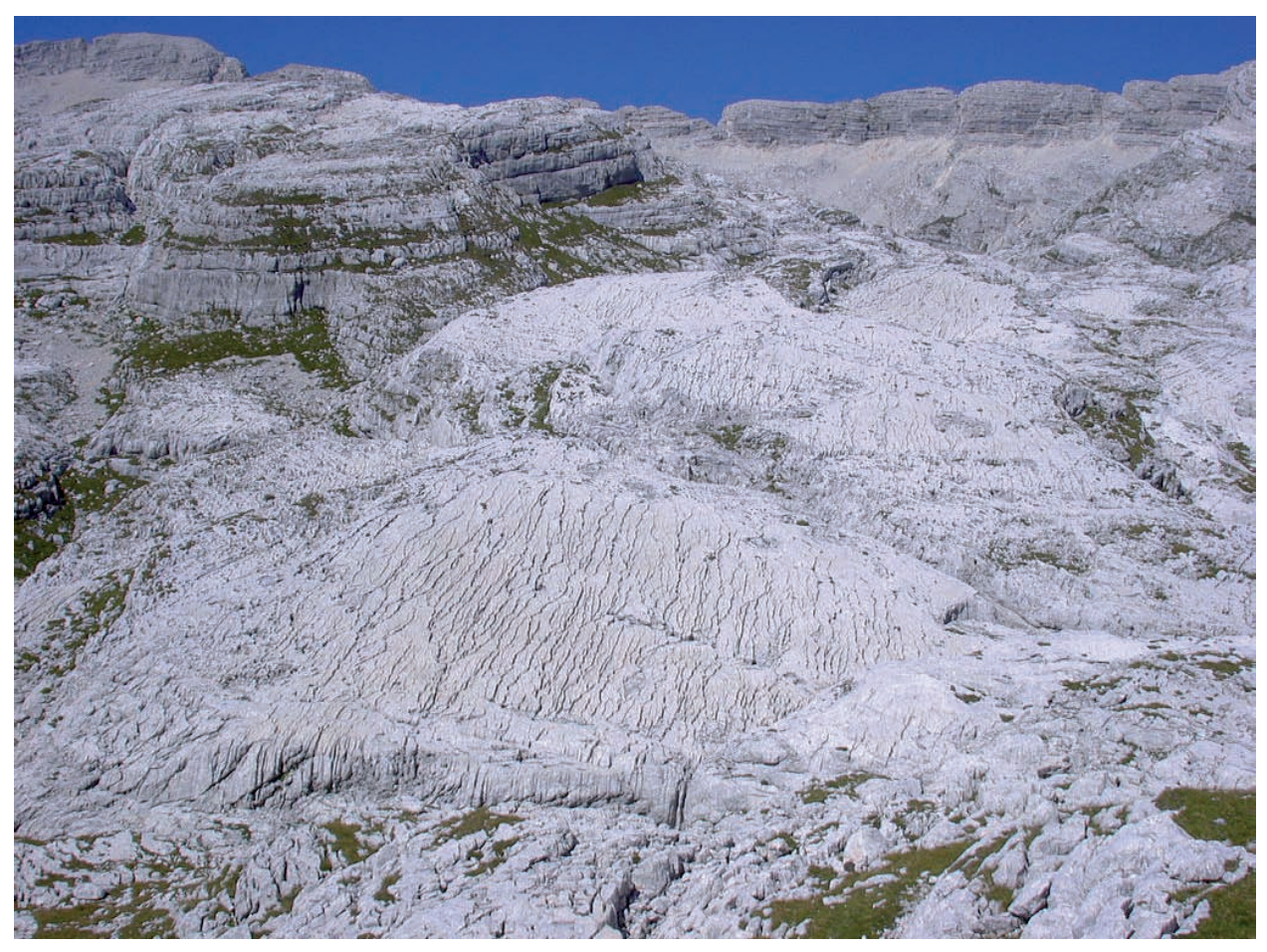
Fig. 3: An example of a bare karst surface on Kanin high mountain plateau (2587 m), where the depth of the unsaturated zone exceeds 1500 m.

value would mainly be influenced by the depth of the unsaturated zone. Due to the enormous thickness of the unsaturated zone, the protective values would often be classified as "moderate", not showing the vulnerability differences within the aquifer itself. Therefore, the selection of only two parameters (soil and lithological characteristics of the unsaturated zone) together with a not very detailed system of protective function assessment could be suitable as well (Fig. 3).