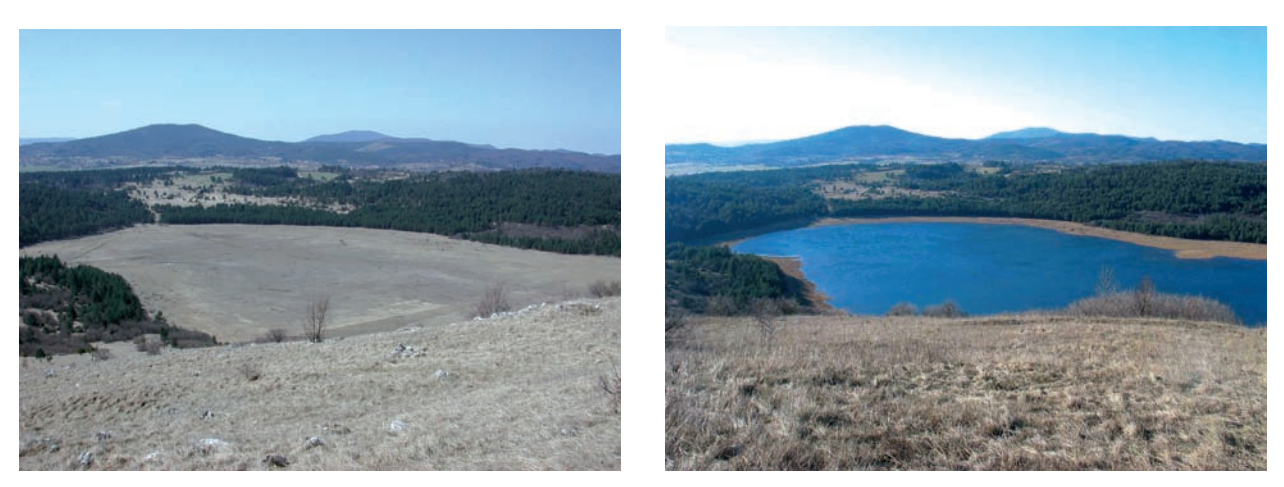
Fig. 4 and 5: The intermittent lake Petelinjsko jezero is flooded up to six months per year. At low groundwater level a shallow karst depression is dry (left), while at high groundwater level it is flooded and forms a lake (right). The degree of vulnerability of the area may vary drastically depending on respective hydrologic conditions.

In the vulnerability assessment, special emphasis must be given on the function of the sinking rivers, which occur within karst poljes or recharge in non-karst areas and sink on the contact with carbonates. The latter can have either huge or small catchments, which has to be considered in vulnerability assessment, since swallow holes are points of concentration of flow, causing fast infiltration of surface waters and contaminants towards