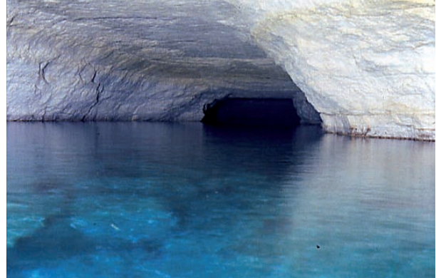
Fig. 3: Groundwater is of great value, but often adds to the beauty of caves: Weebubbie Cave, Nullarbor Plain, Western Australia

Regrettably, even conservation activists may well lack proper understanding of the character and behavior of groundwater. One striking example from this region