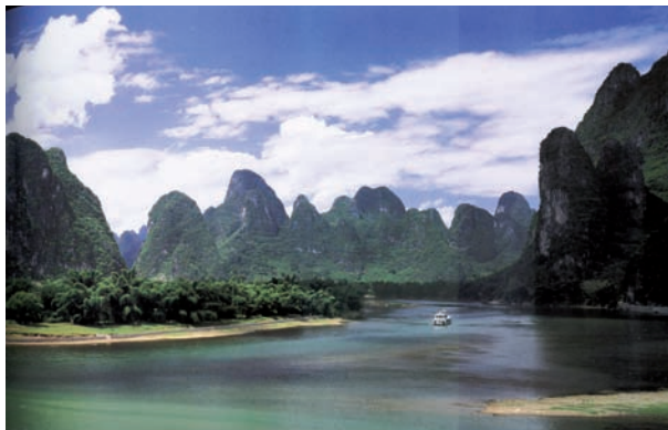
Fig. 1: The famous towerkarst of Guilin in China is famed for its beauty

Many karst systems are places of striking, even sublime beauty (Burke 1756). In turn this is coupled, for many people, with a genuine sense of spirituality. Most such landscapes thus have extremely important cultural values that may even have persisted continually since the Neolithic.