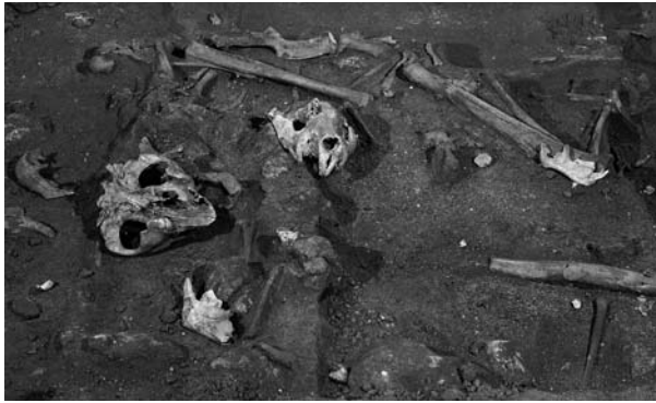
Fig. 7: One page from the Library of the History of the Earth: Victoria Fossil Cave, Naracoorte Caves WHA, Australia

I am glad to say that after two days in the witness box in the course of challenging an application for mining on a particularly important karst area, the judge not