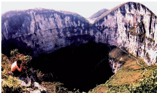
Fig. 5: One of the examples of sublime majesty: the Xiaozhai Tiankeng of China

So, in summary, we must strive for total catchment management and on-going monitoring of recharge or of drawdown. The importance of deliberative environmental restoration is at last being recognised, even though Marsh argued back in 1864 that forests destroyed by human action need human action to ensure their recovery.