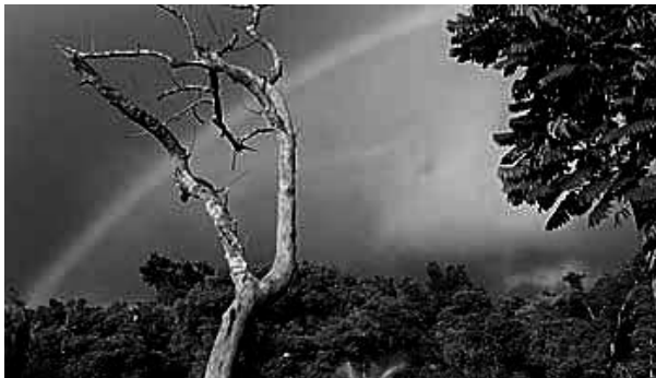
Fig. 13: The Havalu Forest of Niue managed as a "National Park" since the original inhabitants first arrived over 1,000 years ago.

ing muddy run-off entered the river and progressively settled, killing the Chironomid and other larvae which were growing all along the river and which normally provide the food source of the glowworms. In Vietnam, a clumsy road construction mobilized immense amounts of mud into several underground rivers and from there to the major surface streams draining the karst.