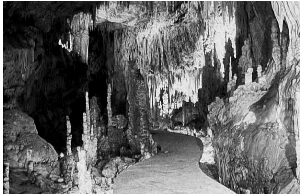
Fig. 14: The main pathway through Jeita Cave, suspended well above the floor on pillars, and with all electric fittings concealed under the pathway

ing muddy run-off entered the river and progressively settled, killing the Chironomid and other larvae which were growing all along the river and which normally provide the food source of the glowworms. In Vietnam, a clumsy road construction mobilized immense amounts of mud into several underground rivers and from there to the major surface streams draining the karst.