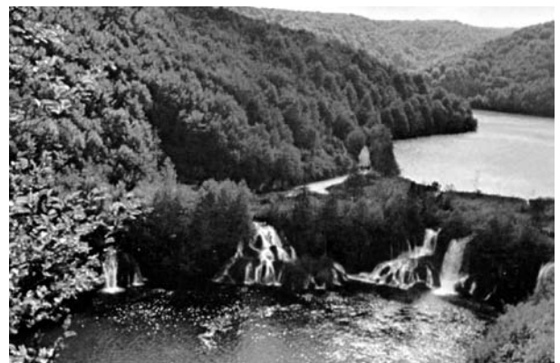
Fig. 16: The beauty of the Plitvice Lakes WHA, Croatia