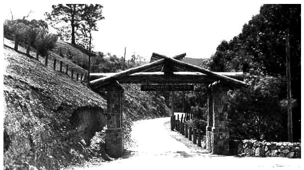
Fig. 11: Buchan Caves, Victoria, preserved as a National Park, now Caves Reserve. (1938 photograph made available by Park Manager D. Calnin)

There is also the potential for adoption of minimal impact codes of practice. Speleologists have used such codes in various forms, e.g., the Honour Code of the Swiss Speleological Society and the Minimum Impact Code of the Australian Speleological Federation. At the other extreme of scale there is an excellent example in the Cement Sustainability Initiative (WBCSD 2002).