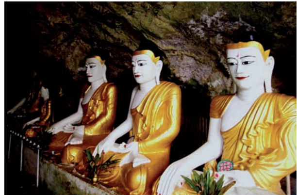
Fig. 4: Khayon Cave, near Mawlamyine, Myanmar (once known as Farm Cave and an important biological site) is a fine example of the religious use of caves

occurred when Croatia first proposed a change of boundary of the Plitvice Lakes World Heritage area in order to encompass (and hence control) the upper section of the catchment area. Many of the referees who were consulted totally failed to recognise the importance of this and argued that the World Heritage Committee should reject the proposal because “it did not add to the biodiversity of