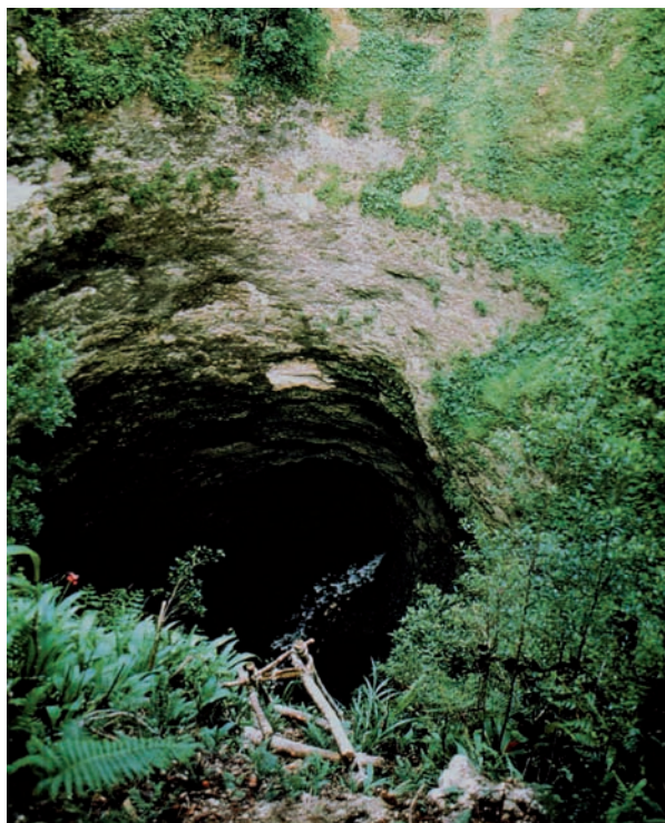
Fig. 6: Another majestic sight: Nare Doline (over 300 m. deep) on the Nakanai Plateau, Papua New Guinea