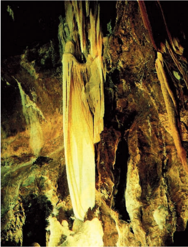
Fig. 2: Temple of Baal, Jenolan Caves, New South Wales

for permanency, and although there is no question that it can be reversed and so restoration may be possible, it is all too rarely attempted. The widespread karst deserts of China are well known, but current research is furthering our understanding of the processes at work, including the formerly neglected role of microbiota.