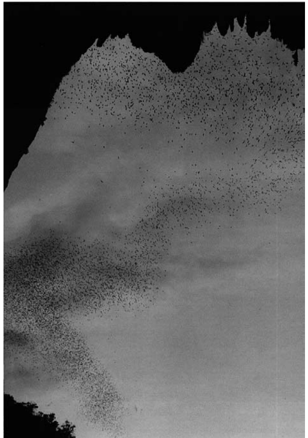
Fig. 9: The bat flight from Deer Cave, Gunung Mulu WHA, Malaysia

only upheld the appeal, but also wrote the precautionary principle into his judgment.