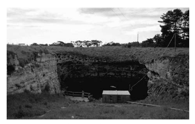
Fig. 8: Gouldens Hole - One of the Cenotes in the Limestone Coast region, South Australia: both a beautiful place and a point of access to an immense groundwater reservoir through both the nineteenth century excavated ramp and the modern pumping station