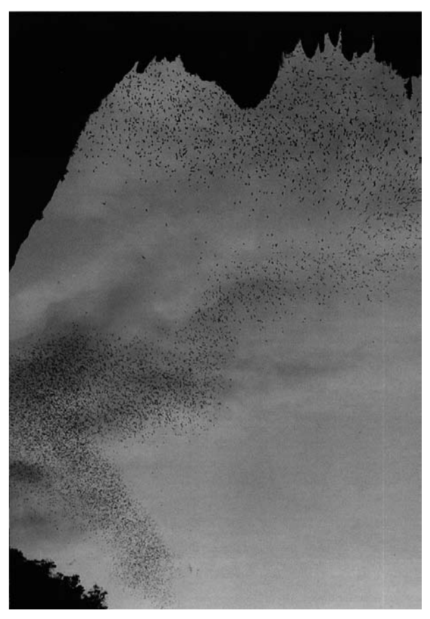
Fig. 9: The bat flight from Deer Cave, Gunung Mulu WHA, Malaysia

only upheld the appeal, but also wrote the precautionary principle into his judgment.