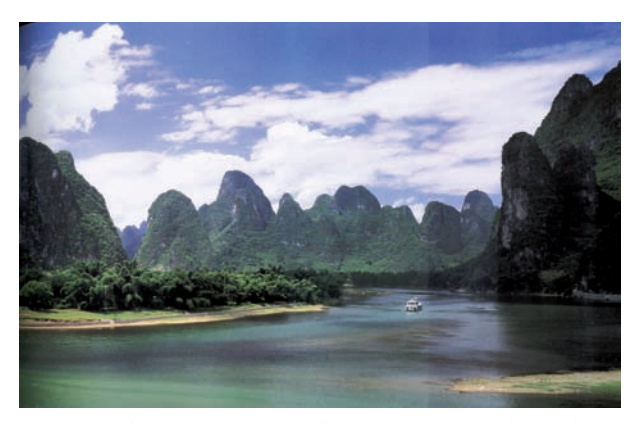
Fig. 1: The famous towerkarst of Guilin in China is famed for its beauty

Many karst systems are places of striking, even sublime beauty (Burke 1756). In turn this is coupled, for many people, with a genuine sense of spirituality. Most such landscapes thus have extremely important cultural values that may even have persisted continually since the Neolithic.