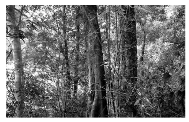
Fig. 12: The wonderful Maolan forest of China, managed on a basis of sustainability by the Shui people

Sedimentation can result from any form of soil erosion or mobilization. In New Zealand, the Waitomo Glowworm cave was threatened when a farmer cleared a hillside some 25 miles upstream of the cave. The result-