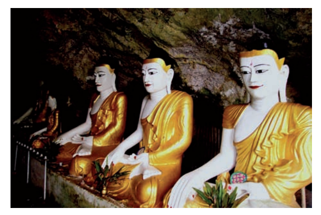
Fig. 4: Khayon Cave, near Mawlamyine, Myanmar (once known as Farm Cave and an important biological site) is a fine example of the religious use of caves

occurred when Croatia first proposed a change of boundary of the Plitvice Lakes World Heritage area in order to encompass (and hence control) the upper section of the catchment area. Many of the referees who were consulted totally failed to recognise the importance of this and argued that the World Heritage Committee should reject the proposal because "it did not add to the biodiversity of