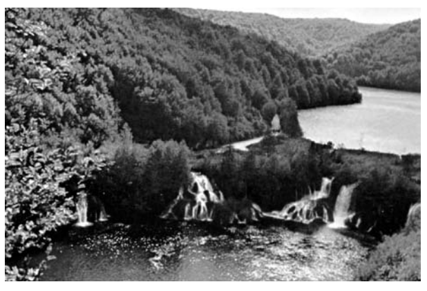
Fig. 16: The beauty of the Plitvice Lakes WHA, Croatia