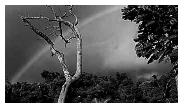
Fig. 13: The Havalu Forest of Niue managed as a "National Park" since the original inhabitants first arrived over 1,000 years ago.

ing muddy run-off entered the river and progressively settled, killing the Chironomid and other larvae which were growing all along the river and which normally provide the food source of the glowworms. In Vietnam, a clumsy road construction mobilized immense amounts of mud into several underground rivers and from there to the major surface streams draining the karst.