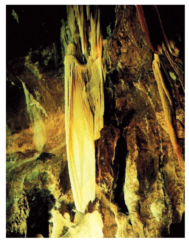
Fig. 2: Temple of Baal, Jenolan Caves, New South Wales

for permanency, and although there is no question that it can be reversed and so restoration may be possible, it is all too rarely attempted. The widespread karst deserts of China are well known, but current research is furthering our understanding of the processes at work, including the formerly neglected role of microbiota.