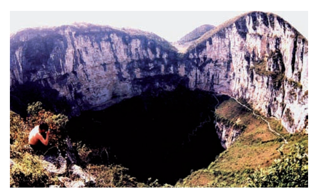
Fig. 5: One of the examples of sublime majesty: the Xiaozhai Tiankeng of China

So, in summary, we must strive for total catchment management and on-going monitoring of recharge or of drawdown. The importance of deliberative environmental restoration is at last being recognised, even though Marsh argued back in 1864 that forests destroyed by human action need human action to ensure their recovery.