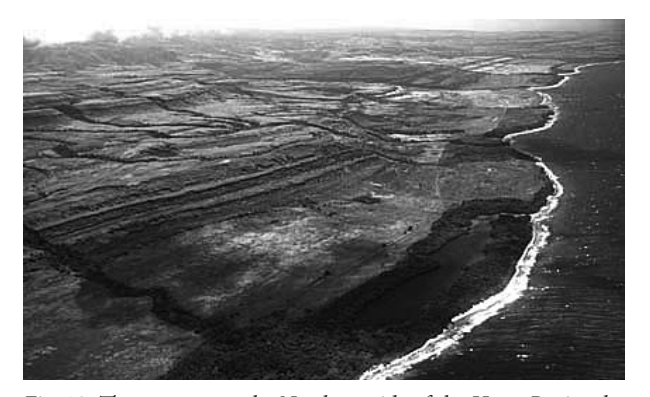
Fig. 10: The terraces on the Northern side of the Huon Peninsula, Papua New Guinea are a wondrous source of geo-climatic history

There is also the potential for adoption of minimal impact codes of practice. Speleologists have used such codes in various forms, e.g., the Honour Code of the Swiss Speleological Society and the Minimum Impact Code of the Australian Speleological Federation. At the other extreme of scale there is an excellent example in the Cement Sustainability Initiative (WBCSD 2002).