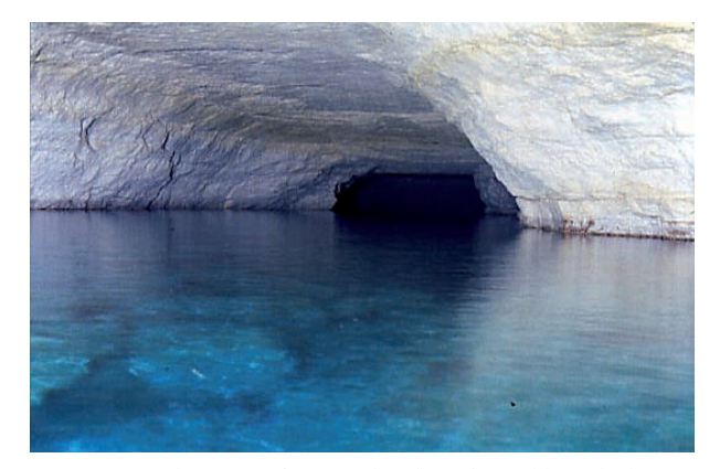
Fig. 3: Groundwater is of great value, but often adds to the beauty of caves: Weebubbie Cave, Nullarbor Plain, Western Australia

Regrettably, even conservation activists may well lack proper understanding of the character and behavior of groundwater. One striking example from this region