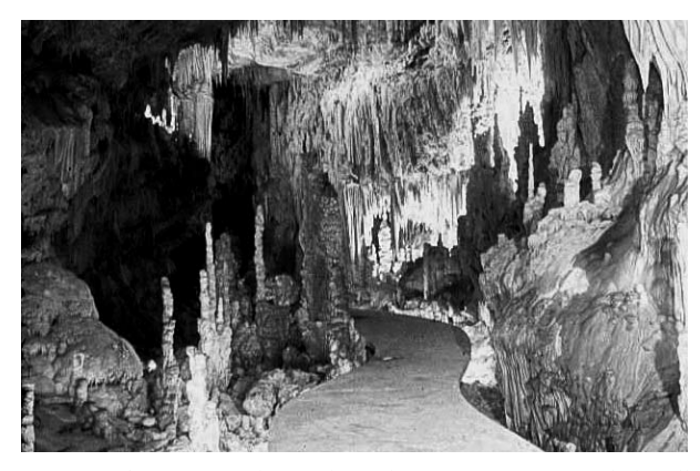
Fig. 14: The main pathway through Jeita Cave, suspended well above the floor on pillars, and with all electric fittings concealed under the pathway

ing muddy run-off entered the river and progressively settled, killing the Chironomid and other larvae which were growing all along the river and which normally provide the food source of the glowworms. In Vietnam, a clumsy road construction mobilized immense amounts of mud into several underground rivers and from there to the major surface streams draining the karst.