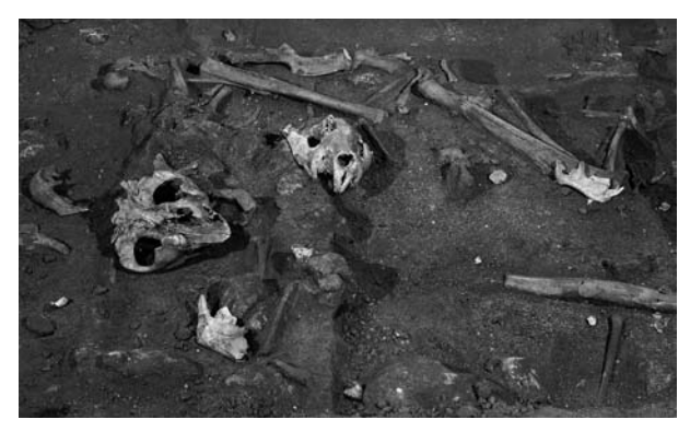
Fig. 7: One page from the Library of the History of the Earth: Victoria Fossil Cave, Naracoorte Caves WHA, Australia

I am glad to say that after two days in the witness box in the course of challenging an application for mining on a particularly important karst area, the judge not