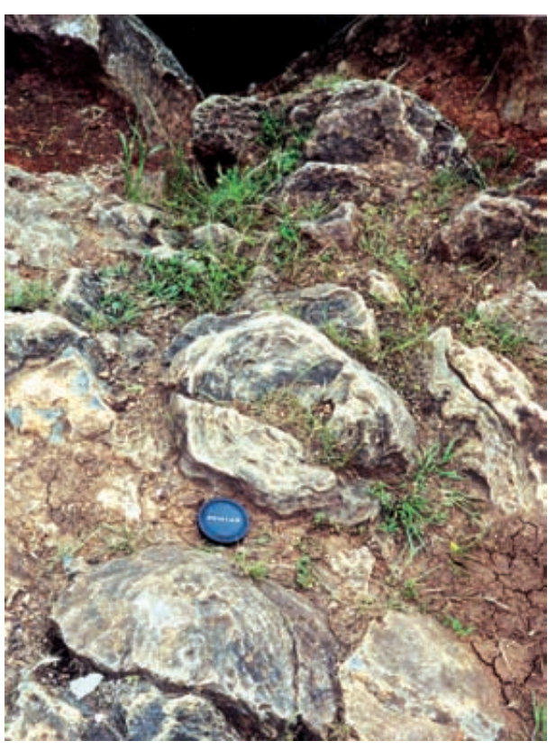
Fig. 2: Speleothem, exposed on surface above Dip Cave, Wee Jasper, NSW, Australia. Cave entrance can be seen top of photo. This speleothem has outlived all of the cave it formed in.

Some cave walls do fail for a variety of reasons. We can observe this in many breakdown chambers and it is possible to recognise the sources of the weakness in the walls that resulted in their failure.