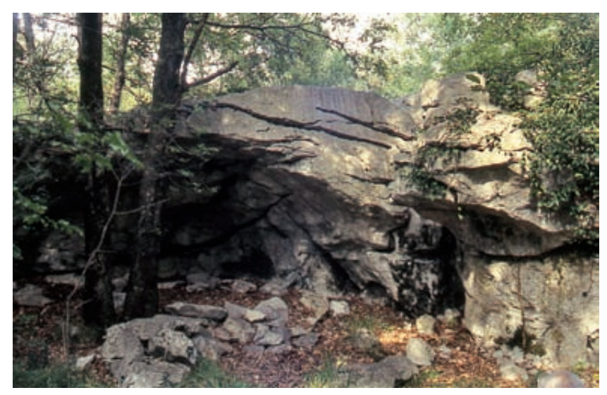
Fig. 3: Looking towards the surviving cave wall from the floor of an unroofed cave, Trieste Carso, Italy.