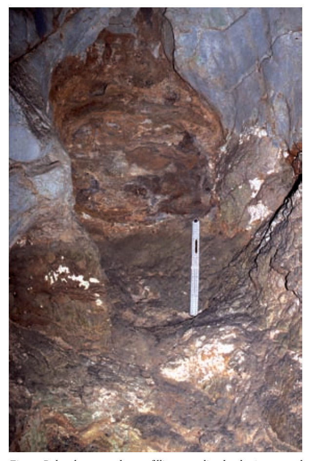
Fig. 5: Palaeokarst sandstone filling spar-lined tube intersected by more recent cave in the entrance area of Lucas Cave, Jenolan Caves, NSW, Australia. The strongly cemented sandstone is younger than the plastic clay shown in Figure 1.

then that while level in the landscape is a good indicator of the age of fluvial caves, it has little to do with the age