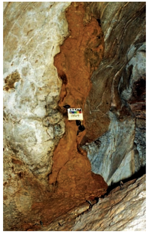
Fig. 1: Plastic illite–bearing clay, mustard yellow, in the River Cave, Jenolan Caves, NSW Australia. The < 2\mu m fraction of this clay was K-Ar dated by Osborne et al., (2006) at 357.30 \pm 7.06 Ma.

Despite many years of working on palaeokarst, I initially found the Early Carboniferous (340 Ma) K-Ar dates for unlithified clays in Jenolan Caves incredible (Figure 1).