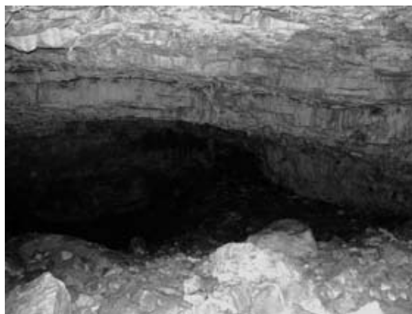
Fig. 2: The large chamber in the Arena cave. In the foreground the debris blocks, in the background the inner "doline".