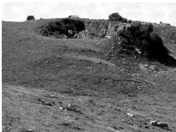
Fig. 1: The collapse depression called Arena.