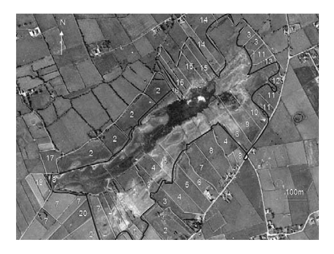
this). Access through this wall or hedge is usually via a gate to the adjacent high water for drinking. These fields provide grazing with water access through the times of highest flood (usually November-February). In exceptionally high flood, the lower portion of the field can be flooded, reducing the area of available grass, but continu-