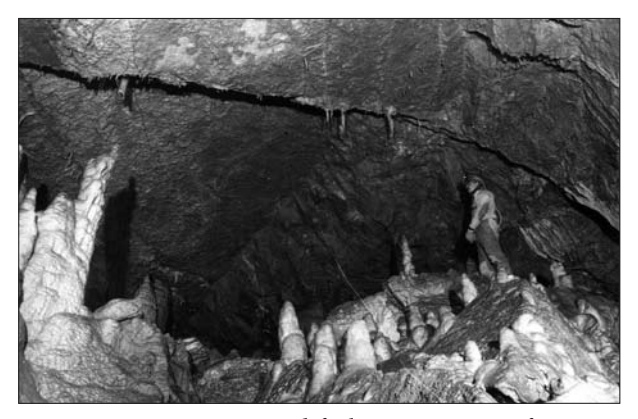
Fig. 4: Cross-Dinaric oriented fault in Pisani Rov of Postojna Cave.

In the northern part of Pisani Rov in Postojna Cave the cross-Dinaric oriented (NE-SW) fault cuts through the ceiling (Figure 4). Below the NW end of the fault fresh cracks are visible on the flowstone. Even if the northern end of Pisani Rov is situated just some metres away from the bottom of Velika Jeršanova doline (Šebela & Čar 2000) we do not believe that the fault is connected