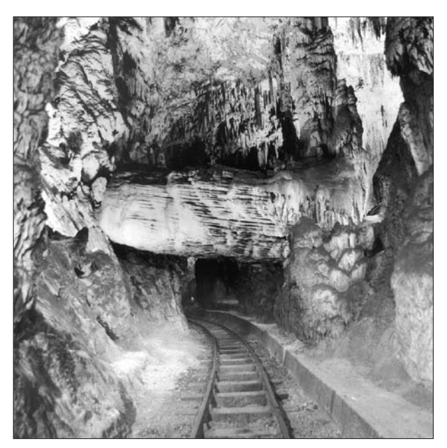
Fig. 1: Zvrnjeni steber in Postojna Cave.

Brodar (1966) thought that frost was the cause of broken flowstone between clastic sediments in the entrance portion of Postojna Cave. Kranjc, in 1999 reports that between March 2 and 3, 1999, a shield style stalactite fell 70 m from the ceiling of Velika Dvorana in Škocjanske Jame. The weight of the speleothem was estimated at 2.500 kilos. The speleothem falling was attributable to changes in drip water chemistry. Mihevc (2001) used U-Th dating to determine that breakage of a flowstone deposit in Divaška Jama occurred 176.000 years BC (within the Mindel/Riss interglacial). He did not hypothesize any cause for the breakage. In another cave, Jazbina v Rovnjah, flowstone deformed by cryoturbation was found to be 241 Ka old (Mihevc 2001). In the example of Snežna Jama the flowstone in the entrance area of the cave was broken by frost action. In addition, flowstones deeper in the cave were deformed by cryoturbation (Bosak et al. 2002).