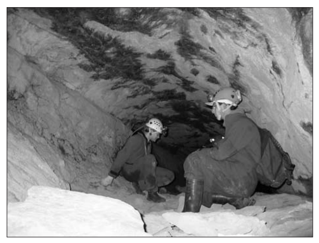
Fig. 2: Pološka Cave, NW Slovenia.

Through research in Pološka Cave (Figure 2), Habič (1971) found that the passages in one part of the cave are developed close to the crossing of two faults. He indicated that the passages are developed along N-S fault zones. However, he did not mention tectonically offset passages. The fact is that Pološka Cave, which is 10.800 m long, is located just about 300 m south from Ravne Fault, which was active in the earthquake of April 12, 1998 (Mw=5.6).