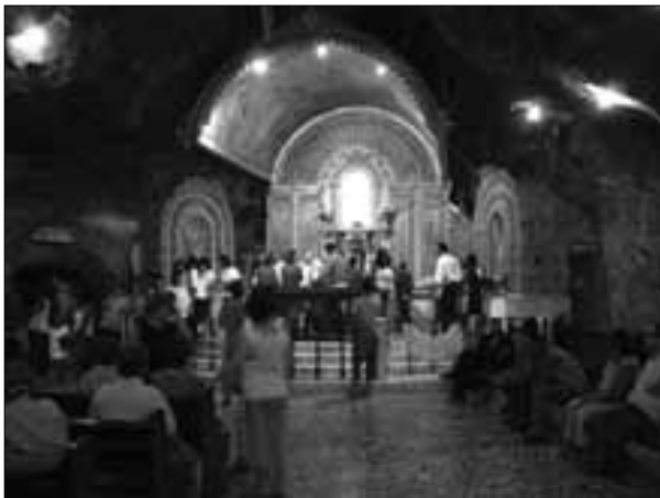
Fig. 2: The main altar of Bom Jesus da Lapa Sanctuary.

According to Sampaio (2002, 137-138), when a visitor enters the cave, the person experiences its extraordinary and exciting atmosphere. The spectator soon enters the darkness seeing the image of the crucified Bom Jesus da Lapa, offering consolation and cure for those who believe and those who have faith. The pilgrim also experiences emotions and look for the miraculous water that slowly drops from de walls and ceilings. Even non-Catholics cannot deny the effect of excitement when one arrives at the Sanctuary of Bom Jesus da Lapa.