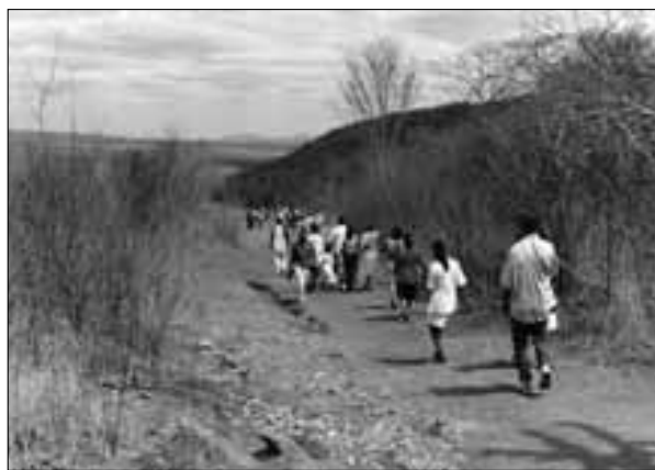
Fig 4: Pilgrims during their journey to the Patamuté Cave.

In other words, the cave became a place that could free them from the suffering caused by the constant droughts or at least minimize it. Steil (1998, 36) calls attention to this phenomenon. Chapels located in wild areas and harsh environment become privileged places for religious pilgrimage and welcome travelers, the sick or adventurers who cross fields and semi-deserts, a context that empowers the recognition of these spaces as sacred spaces (Fig. 4).