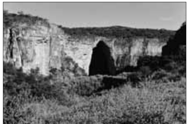
Fig 3: The entrance to the Lapa dos Brejões Cave.