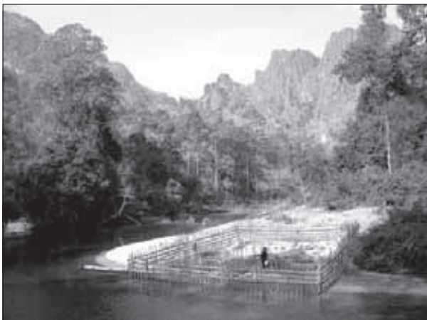
Fig. 19: Riverbank agriculture beneath rugged karst peaks bordering the southern Hinboun polje near Ban Natan, Khammuan Province.

Lo) near Ban Kong Lo (Fig. 18). This cave passes beneath a 700 m high ridge via a river passage 6.3 km long that is regularly traversed by motorized canoes and fishtail boats in about one hour, providing a critical transport link to villages in a second karst margin polje.