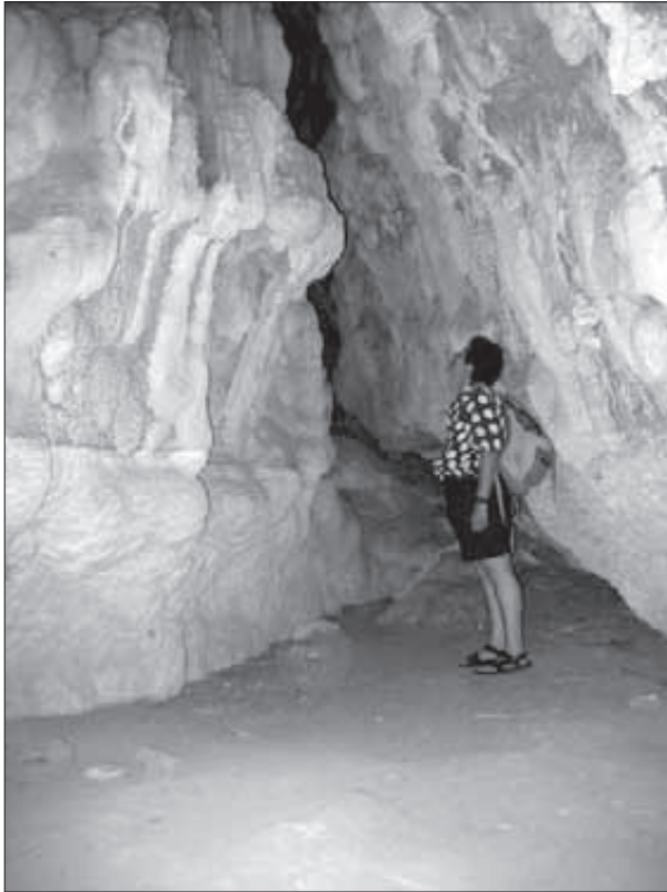
Fig. 7: Cave formed in tufa above Tat Sae, Phu Phaxang Noy area, Luang Prabang Province.

which at least one small but fascinatingly decorated cave has formed well above the present stream level (Fig. 7). On the opposite side of the massif from Tat Sae and 32 km south of LPBC lies Tat Kuang Si, a 140 m high waterfall that cascades from the edge of a tufa accumulation which is at least several hundred metres wide, the top of which forms a very extensive topographic bench (Fig. 8). About 12 km SW of the Tat Kuang Xi near Longkhoay is Tham Loum (1.6 km long) (Dreybrodt & Laumanns 2005 a, c).