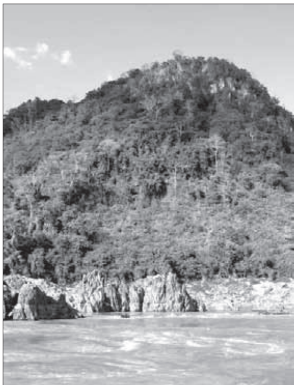
Fig. 3: Degraded forest, northern Xaignabouli Province.

Sainyabuli near Muang Ngoen , south of Pakbeng on the Mekong. This is an extension of the karst that occurs in northern Nan Province, Thailand (Dunkley 1995). At Hong Sa (8), about 30 km SE of Pakbeng, the stone floor of Wat Simungkhun (Wat Yai) is reputed to cover a hole that “leads to the end of the world”. On the eastern side of Sainyabuli province the limestone Pha Xang (Elephant Cliffs) (9) extend parallel to the Mekong River. This area forms the northern end of a discontinuous limestone belt that includes the karsts of Loei Province, Thailand (Dunkley 1995) and further south forms the large limestone belt through central Thailand.