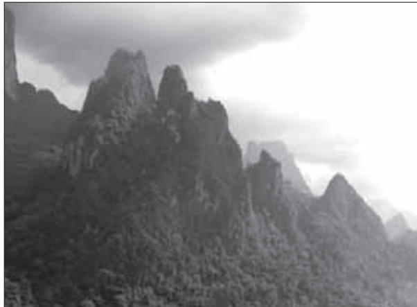
Fig. 10: Karst spires in Phu Khun area, northern Vientiane Province (Photo: Kevin Kiernan).

A belt of rugged limestone hills over 15 km long forms the eastern border of the Nam Ken Valley NE and E of Kasi (25) (Fig. 11). Much of this terrain is well dissected with small farms present on the plains. The high-