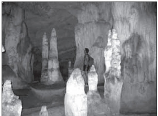
Fig. 15: Speleothems in Tham Pho Kham, Vang Vieng, Vientiane Province.

In far southern Vientiane Province limestone cliffs are visible across the river from the Thai town of Pak Chom (27) but no ground-level investigation was conducted during this study and nor has any published reference to karst phenomena here been located.