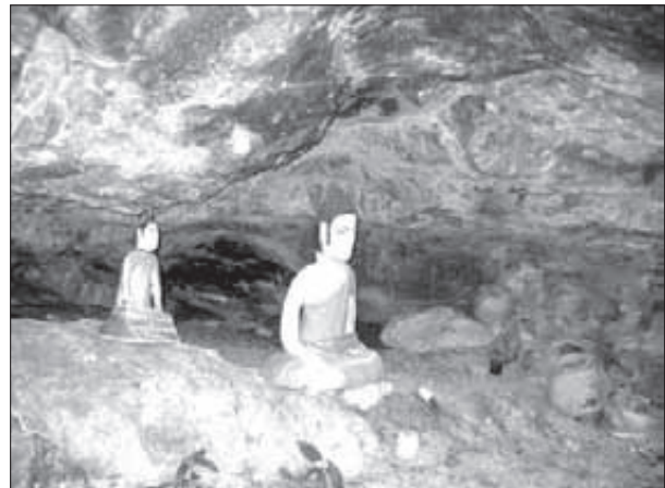
Fig. 20: Statuary in Green Mountain Cave on Don Khong in the Si Phan Don (Four Thousand Islands) area, Champasak Province.

Northeast Champasak is dominated by the sandstone Bolaven Plateau, but topographic maps and some reports suggest limestone may occur in the Mekong Valley downstream of Ban Mounlapamuk and through the area of Muang Khong amid the Si Phan Don (Four Thousand Islands) (38). This area, where the Mekong broadens to 14 km in the wet season, lies upstream of Cambodia's Stoeng Treng karst (39). About 2 km north of Muang Khong on Don Khong (Khong Island) lies Tham Phu Khiaw (Green Mountain Cave) (Fig. 20) but this is not a karst feature and is formed in non-carbonate rocks.