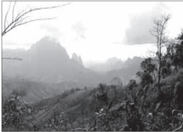
Fig. 9: Phu Phra , Phu Khun karst area, viewed from ridge leading to Maung Phu Khun . Security in this area has long been questionable due to numerous attacks on road traffic by insurgents and/or bandits.

Maung Phu Khun (24) is a strategically important village located 100 km south of Luang Prabang along the road to Vietianne, at the turnoff to Phonsavan and the Plain of Jars. It is an area of high limestone peaks including the spectacular Phu Phra , a site considered holy by both animists and Buddhists (Figs. 9, 10). The first known systematic cave exploration occurred in 1995 during which Tham Seua and Tham Lot were linked underground with 2.7 km of passage surveyed, including a highly decorated upper level network. Tham Dout also exceeds 1 km length.