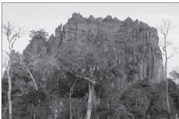
Fig. 16: Limestone summit at the southern end of the Phu Nokkok ridge system, Bolikhamsai Province.

Spectacular karst scenery occurs in the Lak Sao area (28), and there are hot springs and caves about 17 km NW of the town, the best known being Tham Mangkhnon (Cummings & Burke 2005). Further west the main belt of carbonates, up to 40 km wide, appears to extend north-south across central Bolikhamsai Province. The relatively pristine Nam Kading flows through some spectacular karst. Spectacular karst peaks surround Ban Na Hin (Khoun Kham) (29), the main construction town for the Nam Theun dam, located on Route 8 at 41 km from Route 13, and they provide an imposing backdrop to the Tat Namsanam waterfall, 3 km north of the town. In the SE corner of Bolikhamsai rugged fengcong (Fig. 16)