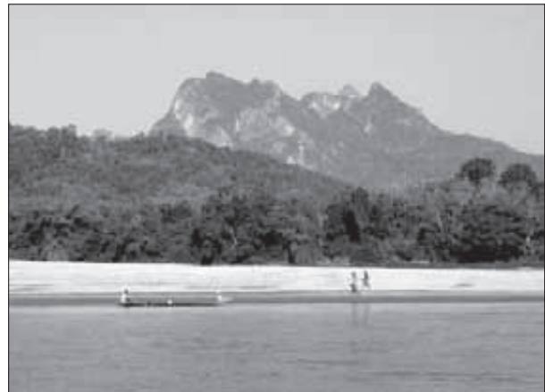
Fig. 5: The ruggedly karstic northern end of Phu Longhuay, Luang Prabang Province.

Limestone hills are prominent on the eastern side of the Mekong around the ancient provincial capital Luang Prabang city (LPBC) (15) which was accorded World Heritage status for its cultural values in 1995. In the centre of the town lies the limestone hill of Phu Si, within which a small cave shrine is located. Caves also occur north of LPBC near Ban Man Phone Sai. About 6 km downstream from LPBC lies Tham Din, 280 m inside