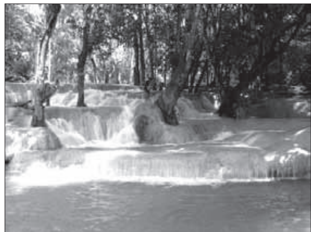
Fig. 6: Tufa cascades at Tat Sae, Phu Phaxang Noy area, Luang Prabang Province.

which the remains of a bamboo ladder into a short shaft were encountered by Dreybrodt & Laumanns (2005 a, b), although their exploration was abandoned due to high CO 2 levels. The Phou Longhuay plateau , which reaches 1,606 m altitude (Fig. 5), lies about 14 km east of LPBC. It stretches NE-SW for about 30 km, its northernmost edge demarcated by the 900 m deep gorge of the Nam Pa, NW of which is an extension of the massif complex. Dreybrodt & Laumanns (2005 a, b) have reported some small caves on the NW margin of the Phou Longhuay Plateau