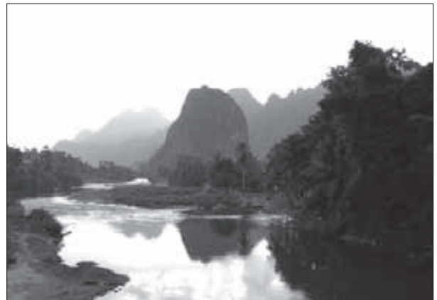
Fig. 12: Limestone mountains overlooking the Nam Song near Ban Phatang , northern Vang Vieng area, Vientiane Province.

the broad Nam Song Valley , while schists and lavas form the highest summits slightly further west ( Hedoiin & Renouard 2000; SpeLAologie 2007 ). In the north, upstream