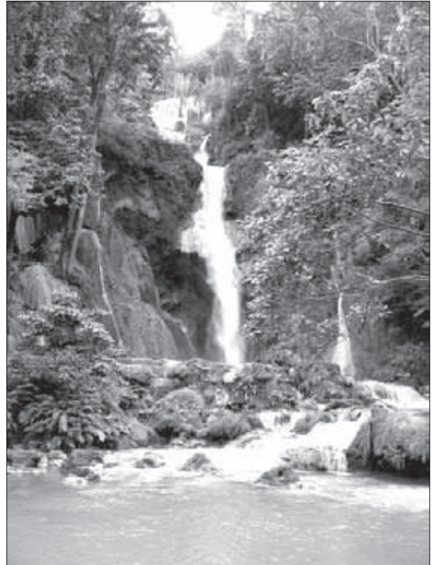
Fig. 8: Tat Kuang Si cascading over a massive accumulation of tufa, western side of Phu Phaxang Noy karst area, Luang Prabang Province.

About 30 km SE of LPBC lies the Phou Phaban massif, which extends for about 20 km NE-SW and attains 2,212 m altitude. Its southern edge is incised by the Nam Khan, which joins the Mekong at LPBC. About 32 km up the Nam Khan from the Xiangngeun near the village of Ban Kengkoung, lies Crystal Cave (400 m long) (Dreybrodt & Laumanns 2005 a, c). Further afield, the Muang Nan area (16) is located about 1.5 hours drive south from LPBC in the SE corner of Luang Prabang province shortly before the road to Sainyabuli crosses the Mekong River. Several caves are known locally, reaching 1.4 km length and 106 m depth (Eskes & Damen 2000). Karst also occurs around the town of Vieng Thong (17), along Route 1 on the border of Luang Prabang and Xieng Khuang provinces, some of which has been investigated