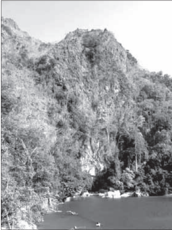
Fig. 18: Resurgence of the Nam Hinboun (Tham Kong Lo) at the upstream end of the northern Hinboun polje, Khammuan Province.

Lo) near Ban Kong Lo (Fig. 18). This cave passes beneath a 700 m high ridge via a river passage 6.3 km long that is regularly traversed by motorized canoes and fishtail boats in about one hour, providing a critical transport link to villages in a second karst margin polje.