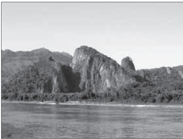
Fig. 4: Limestone bluffs on lower Nam Ou near its confluence with the Mekong, Luang Prabang Province. Lighter coloured vegetation on ridge in background is regeneration of areas previously cleared for slash and burn agriculture.

with the Mekong (Fig. 4), about 25 km upstream from LPBC. Two caves at this site contain large numbers of Buddha images and have long been utilized for tourism. South of Pak Ou are tower-like residual limestone hills that rise from non-carbonate basement rocks in the Chompe – Chomngoua area (14). Tham Khou Ha Sakhalin (120 m long) lies on the western side of the Mekong about 10 km upstream from LPBC in an area where the limestone relief is about 300 m. The archaeological site of Tham Hua Phu also occurs in this area. Further inland where some summits rise to over 1,000 m altitude there are further caves including Tham Long in the Huay Lom valley under Phoulouang, and Tham Nang Anh 2-3 km down-valley towards Ban Som. On the N side of the Huay Tan about 3 km WNW of its confluence with the Huay Lom lies Tham Pho Xae. Tham Xang lies under Phu Xang near the head of the eastern branch of the Huay Ghan, which joins the Mekong 2 km downstream of LPBC (Ecotourism Laos 2007). Several other caves also occur on the western side of the Mekong opposite LPBC, including the 100 m-deep Tham Sakkarin Sannakuha, which contains the cave temple Wat Tham Xieng Maen. At least one other small cave has been reported 1 km upstream from Chomngoua (Dreybrodt & Laumanns 2002).