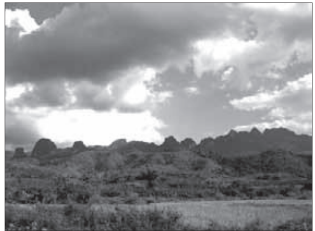
Fig. 11: Limestone summits along the eastern margin of the Nam Ken Valley , Kasi area, Vientiane Province.

Vang Vieng (26) is located about 56 km south of Kasi and 110 km north of Vientiane. Here dark-coloured, well fractured and highly karstified Permian limestone occurs over an area of about 30 km N-S and 15 km E-W. This limestone forms mountains along the western margin of