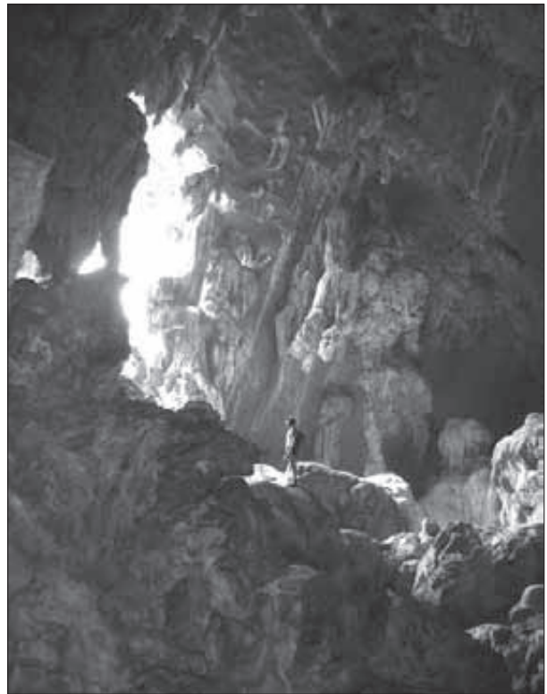
Fig. 14: Entrance chamber, Tham Pho Kham, Vang Vieng, Vientiane Province.

About 14 km north of Vang Vieng town and overlooked by the impressive Phu Nampin (1,736 m) lie some heavily-visited caves. They include Tham Nam, source of a tributary of the Nam Song and frequently penetrated for about 500 m by tourists who float through on inflated car-tyre inner tubes; the small Tham Sang, which contains Buddha images; nearby Tham Loup; and the extensive Tham Hoi (3 km long?) (Cummings & Burke 2005). Further south along the foothills west of the Nam Song are several other caves including Tham None and Tham Pha Puak. Several significant caves occur in the Nam Kha and Nam Koang valleys. Various caves, such as the large Tham Jang, have been used as sanctuaries against marauding armies, and some contain religious icons. A large reclining Buddha occupies the very large entrance chamber of Tham Pho Kham (Fig. 14) and its large inner passages are spectacularly decorated by large speleothems, but unfortunately these have been badly despoiled by traipsed mud (Fig. 15) and there is also abundant graffiti. Two very large resurgences occur at the foot of the nearby cliffs. Another well-known but less spectacular cave in this area is Tham Pha Jao (Hedoiin & Renouard 2000; SpeLAOlogie 2007).