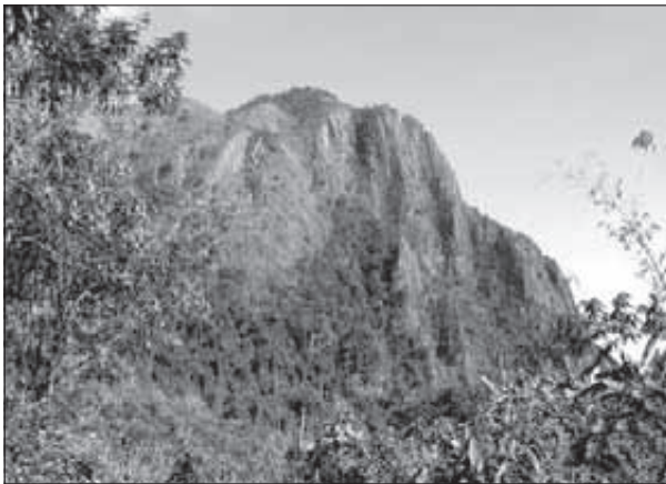
Fig. 13: Limestone mountains NE of Ban Na Thong, Nam Kha valley, Vang Vieng area, Vientiane Province.

of Ban Phatang (Fig. 12), the highest summits rise 1,200-1,400 m above the valley floor. Two major tributaries from the east, the Nam Xang Nua and the Nam Xang Tai, both with catchments of several km 2 , sink in very large closed depressions on the lower slopes of these mountains. Further south craggy limestone summits of up to 1,480 m (Fig. 13) border the broad Nam Kha and Nam Koang valleys that drain eastwards into the Nam Song just south of Vang Vieng town (230 m altitude). Rugged karren is typically present on the steep hillsides, beneath which there are numerous caves.