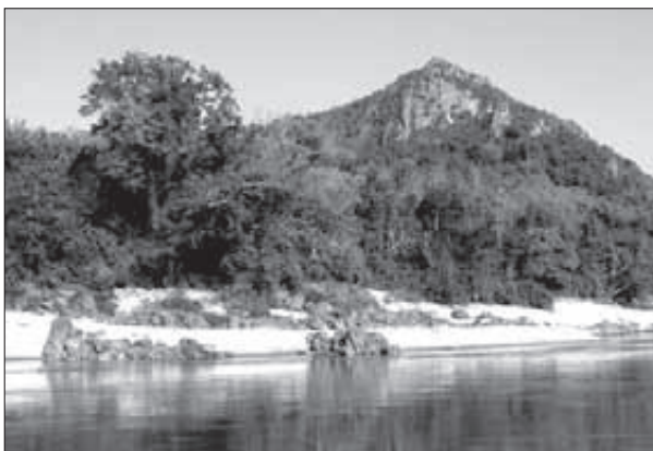
Fig. 2: Karst of northern side of Mekong downstream of Ban Houayhang, southern Oudom Xai Province.

This province stretches NNE-SSW from Phongsali to the Thai border south of Bokeo province. Carbonate rocks that often form very rugged topography are widespread along western Oudom Xai adjoining Luang Nam Tha province, and also occur in the southeast, adjoining Luang Phrabang province. Near the provincial capital Oudom Xai (Muang Xai) (1) the waterfall Tat Lak Sip-Et cascades over a limestone cliff. On the western bank of the Nam Tha about one third of the distance between Nam Tham (in neighbouring Luang Nam Tha Province) and Maung Pak Tha, at the confluence of the Nam Tha and Mekong, lies the spacious Tham Davadeung, a short distance from Ban Mo (2). It contains a large Buddha statue and there is a locked gate at its entrance. There are further caves near Ban Peng (3), 45 km NE of Maung Pak Tha. The carbonates reach south to the Mekong River in the Ban