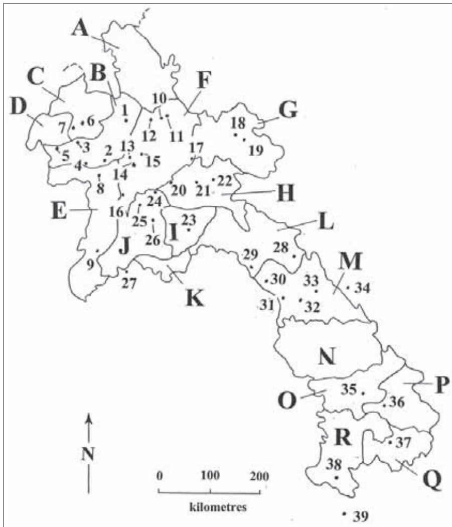
Fig. 1: Localities mentioned in text.

The topography over much of the Lao PDR is very rugged. The jungle-covered Truong Son (Annamite) cordillera stretches 1,100 km from Xieng Khouang in Laos to the Central Highlands of Vietnam with peaks at 1,500 - 250 m. The highest summit is Phu Bia, to the north of which lies the extensive Xieng Khouang plateau (1,200 m). For much of their length the Truong Son forms the border between Laos and Vietnam, but in the north it broadens into the wide Tran