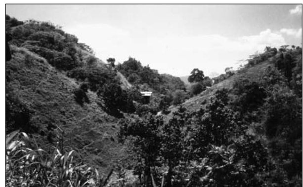
Fig. 4: Cone karst, Trinidad.

Other studies have emphasized the variability of the Caribbean carbonate sequences, and how this has influenced karst development (e.g., Nunez Jimenez 1984; Monroe 1976). Perhaps most significantly, the Caribbean islands, in particular the Bahamas, nurtured the development of the Carbonate Island Karst Model (CIKM), which recognizes that eogenic island karst development is distinct from karst development in larger islands or continental settings (Myloie 2004; Myloie & Carew 1990, 1995, 2000).