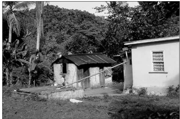
Fig. 6: Rainwater collection, Belize.

Occasional collapse and subsidence also occur, although the Caribbean has not yet suffered their effects as catastrophically as elsewhere (Waltham et al. 2005). Certain sites, such as lower slopes and depression bases, are especially prone to collapse, but only about 10-15% of sites show any evidence of collapse or subsidence, suggesting that collapse probabilities are generally low (Day 1984, 2003a). Despite these relatively low probabilities, both ground surface collapse and subsidence represent an increasing threat to developing infrastructure, such as highways and public service facilities, plus a minor hazard to rural dwellings and livestock. Slope failure also poses a minor to moderate hazard to buildings, roads and other structures, although one that is rarely recognized (Day 1978).