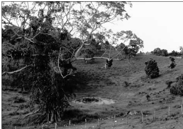
Fig. 2: Doline, Jamaica (Photo: M. Day).

ciated with bauxitic infills. Vegetation varies from xerophytic scrub to wet tropical broadleaf forest, with many species endemic to specific islands.