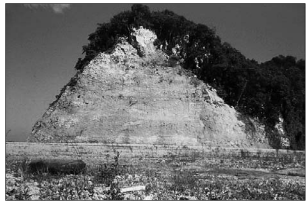
Fig. 5: Tower karst, Puerto Rico.