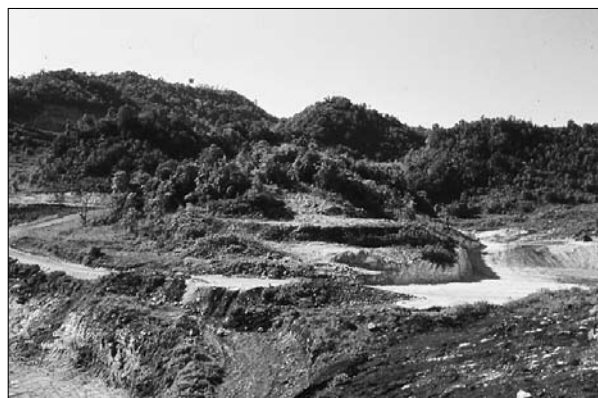
Fig. 8: Bauxite mining, Jamaica.

Much of the Caribbean karst remains in rural land uses, but urbanization is increasing, particularly in the vicinity of large cities such as San Juan, Port of Spain, Montego Bay, St Johns and Bridgetown. Urban development places increasing demands on the karst for construction materials, and changes irrevocably the inherent structure of the karst land surface, its landforms and hydrology. Large urban areas also exacerbate demands on karst groundwater resources.