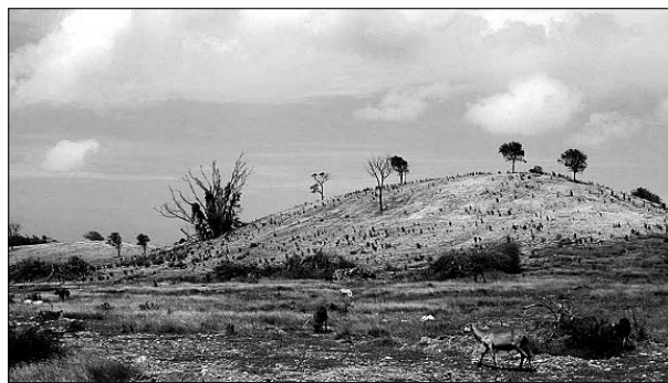
Fig. 7: Soil degradation, Antigua (Photo: M. Day).

Forest clearance and agriculture have had profound and long-term effects on the karst landscape. Much of the karst is utilized for some form of agriculture, and these activities are increasing steadily. Loss of native vegetation and declining habitat apart, some Caribbean karst area soils have been degraded, and their physical and chemical characteristics modified by plowing, cultivation, drainage modification and use of chemicals (Fig. 7). Sediment eroded from agricultural lands frequently has blocked sinkholes and other karst drainage features, and flooding has been exacerbated locally by infilling of sinks and depressions.