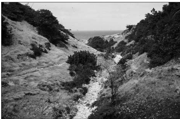
Fig. 3: Dry valley, Barbados.