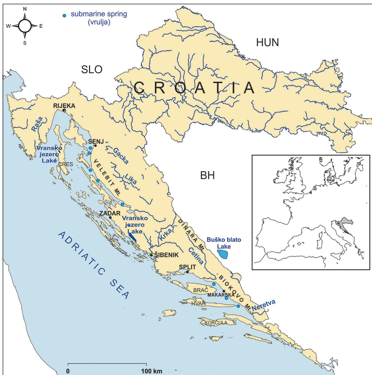
Figure 1: Area of Fortis' journeys and geographical locations of studied karst hydrology features.

Alberto Fortis was one of the few European naturalists who visited today's Croatia in late 18 th and early 19 th century. His work was noted across the Europe and was since subjected to numerous analyses. One of the earliest