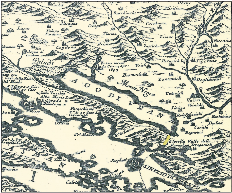
Figure 3: Vransko jezero Lake shown on the segment of map by V. M. Coronelli from 1688 without artificial canal built in 1770 (marked in yellow).