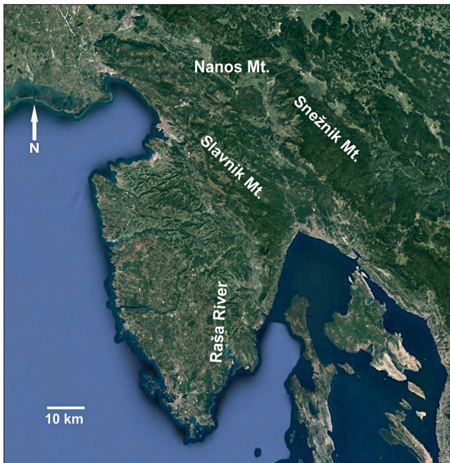
Figure 2: Spatial relations between Raša River and Slavnik, Snežnik and Nanos mountains.

most researched features are tufa deposits, which also caught Fortis' attention. He claimed that tufa deposits are found in limestone rivers , but only in shallow and fast flowing water. He described tufa as a form of fitoliti (phytolith). Furthermore, he claimed that tufa could be formed in slow moving water only if the water is thermal , and that the size of tufa deposits in slow-moving waters is greater than those in fast-moving waters, but the density and the mass of tufa in fast-moving waters is greater. He compared these processes to those he observed in caves. For example, stalagmites, which are made of more pure and compact material than the stalactites due to the height from which water is dripping on the cave floor because the water is full of salty atoms and particles which can crystalize whereas the flow of water which forms crust on stalactites contains more poorly coloured clayish particles . When describing Skardinski buk waterfalls, most prominent example of tufa barriers on Krka River, Fortis mentioned wavy tufa made of grainy salt , which people often collect erroneously believing that it is petrified wood. Fortis stated that the tree rings in this kind of tufa are actually layers of tufa deposited in various periods of the past and that the differences in their colour