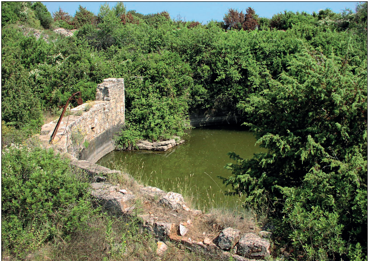
Figure 5: An example of preserved pond, possible Fortis' muddy reservoir (Šolta Island).

which they believed was Krka River. Their claims were based on the remains of the canal found along the banks of the Krka River, but Fortis sees that canal as too small and in such poor condition that it could not transport water further than the nearby town of Skradin. He also