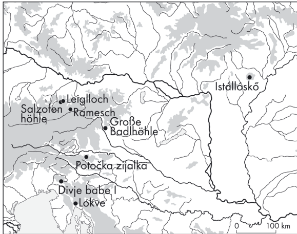
Fig 1: Map of the sites with cave bear bone „flutes“ and of the Ramesch cave.

located along the long axis of the bone, therefore it is not surprising that, should there be more than one hole, they are positioned lineally (e.g. the fragment of a cave bear rib from the Ramesch cave: Albrecht et al. 1998, fig. 5). Additionally, the dental formation of the jawbone could produce holes in a row (D’Errico in paper presented at the conference).