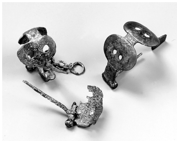
Fig. 7: Photograph of brooches Nos. 15, 16 and 17 (left to right). Not to scale.

The brooches from this group were probably made in a technique similar to that used for brooch-