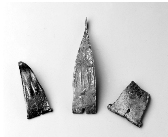
Fig. 1: Photograph of brooches Nos. 1-3 (left to right). Not to scale. Sl. 1: Fotografija fibul kat. št. 1 (levo), 2 (v sredini) in 3 (desno). Brez merila.

1. Bow and hinge of a brooch (the foot and pin do not survive). Brass; the axis of the hinge is iron. The present very thin dark brown layer of corrosion is probably sulphidic and was not present on the original surface, but was only evident after the original layer of corrosion had been deliberately removed (the unskilled action of the finder). The brooch was made by hammering and the decoration is chased. The hinge, which is slightly wider than the bow on the left side, was made by twisting inwards the sheet metal of the bow and then pressing its sides down, probably in order to at-