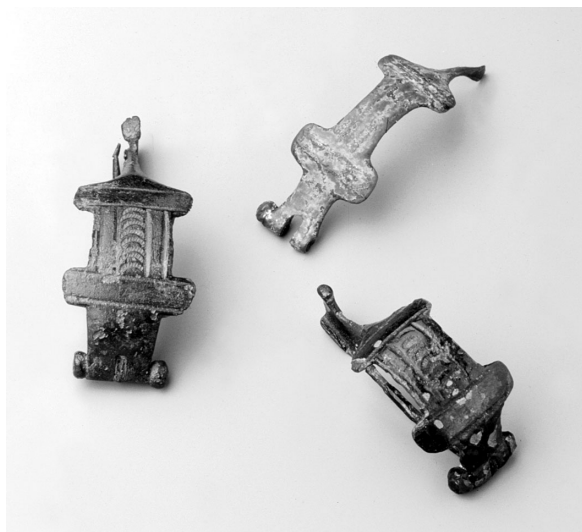
Fig. 3: Photograph of brooches Nos. 8 (left), 10 (above) and 9 (right). Not to scale.

Sl. 3: Fotografija fibul kat. št. 8 (levo), 10 (zgoraj) in 9 (desno). Brez merila.