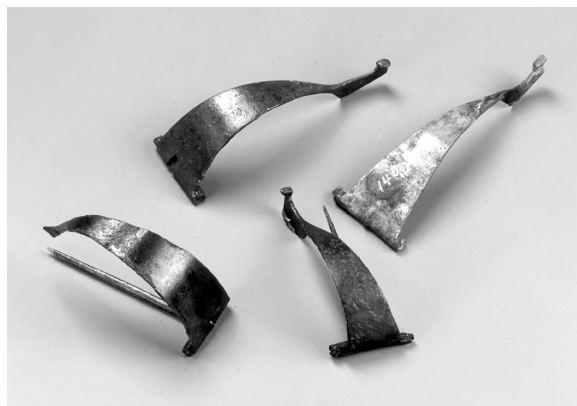
Fig. 2: Photograph of brooches Nos. 4, 5, 6 and 7. Not to scale. Photographic archive of the Archaeological Department of the National Museum of Slovenia (photo: Tomaž Lauko). Sl. 2: Fotografija fibul kat. št. 4, 5, 6 in 7. Brez merila. Fototeka Arheološkega oddelka Narodnega muzeja Slovenije (foto: Tomaž Lauko).

Brooches Nos. 4-7 are similar to a brooch from Magdalensberg (Demetz 1999, 158) and another one from Alesia (Brouquier-Reddé, Deyber 2001, 299, pl. 92: 62: from the upper part of the filling of the ditch of camp C, where there is risk of later contamination). Generally similar to these are two brooches from Ljubljana, dated on stratigraphic grounds to between approximately 50 and 25 BC (Vičič 1994, 27, 30, pl. 1: 8,9).