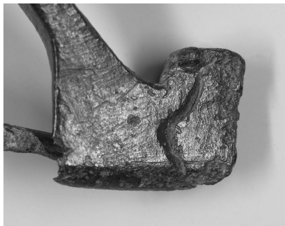
Fig. 4: Photograph of the foot of brooch No. 9. The undulating groove is the result of folding back the end of the foot and hammering it inwards (cf. description p. 194). Lines caused by filing the area are also visible. Larger than life-size.

10. Brooch, partly preserved: parts of the head, foot and pin are missing. Brass; the axis of the hinge is iron. The brown areas of the present surface comprise a thin layer of corrosion on the metal core, whereas the superimposed light green patches above it