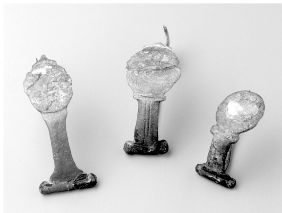
Fig. 6: Photograph of brooches Nos. 13, 14 and 12 (left to right). Not to scale.

12. Brooch, with parts of foot and the pin missing. Brass; the axis of the hinge is iron. The original surface does not survive. The present surface, which has developed over the surface of the metal core, is brown on the upper side of the brooch; on the underside, are traces of a light green powdered corrosion. On the upper side of the central oval plate is a lead-tin solder with a tiny fragment of a thin silver coating, which originally probably covered the whole of the oval expansion. Because the brooch is not well preserved, the lateral expansions adjoining the central oval are poorly pronounced and the groove on the front side of the bow is barely apparent. The hinge has knobbed ends on both sides, from which the iron axis protrudes at the side. The corrosion products of the axis have partly covered the left half of the hinge. Cast and hammered. Preserved length 96 mm, width 20 mm.