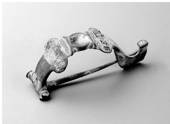
Fig. 5: Photograph of brooch No. 11. Not to scale. Photographic archive of the Archaeological Department of the National Museum of Slovenia (photo Tomaž Lauko).

11. Brooch, complete. Brass, the upper part of bow is tinned; the axis of the hinge is iron. The original surface is relatively well preserved in the tinned parts and in light green powdered corrosion (on the underside of the bow it is covered with a thin layer of earth), which in places (on part of the foot, pin, and a small part of the underside area of the bow) has been rubbed off down to brown corrosion on the metal core. Cast and hammered. The badly preserved decoration on the bow was probably chased. On the outside of the knobbed ends of the hinge, corrosion from the iron axis of the hinge is clear. Length 51 mm, width 15.5 mm.