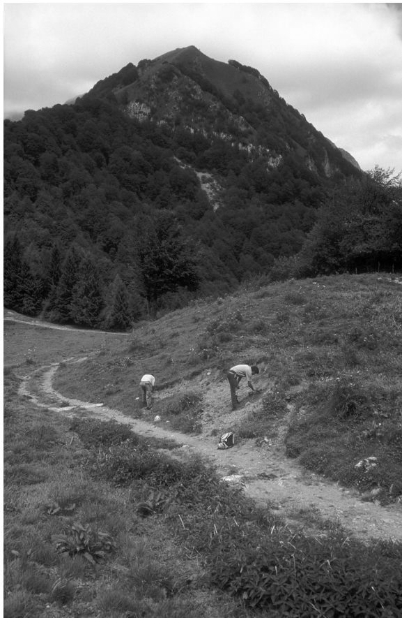
Sl. 2: Najdišče na Pretovču.