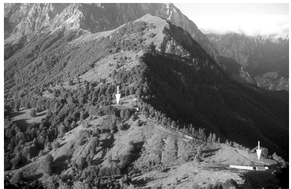
Sl. 1: Pogled na planino Pretovč z Mrzlega vrha. S puščicami sta označeni najdišči na Gorenjem Pretovču (levo) in na Pretovču (desno).

Za volčanski apnenec so značilne pole in plasti roženca, ki so debele do 10 cm. Roženec ima izvor v radiolarijih in spikulah spongij in je nadomestil bolj debelozrnati del kamenine. V bližini je severno od planine nariv, ki ga sestavljajo zgornje