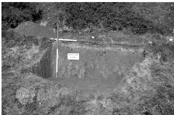
Sl. 3: Očiščen JZ profil pred izkopom sonde na Gorenjem Pretovču. Sl. 3: Outline of SW profile before excavation of the exploratory trench on Gorenji Pretovč.

Pred izkopom sonde smo ob njenem JZ robu, ki ga je že močno načela erozija, odkopali profil do globine 76 cm (sl. 3). Ugotovili smo tri plasti: plast ruše s humusom debeline do 15 cm, plast ilovnate zemlje debeline do 30 cm ter plast močnejše ilovnate zemlje. Med kopanjem profila smo ugotovili koncentracijo najdb v 2. plasti. Matične lapornate osnove nismo dosegli.