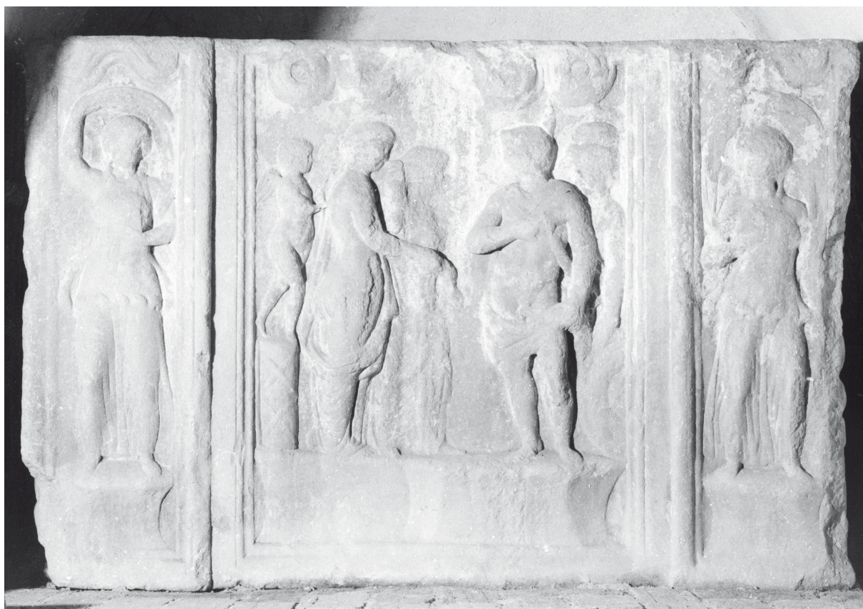
Fig. 2: Socle of a funerary monument at Gornji Grad. In lapidarium, after 1955. Sl. 2: Spodnji del grobne edikule v Gornjem Gradu. V lapidariju, stanje po letu 1955.