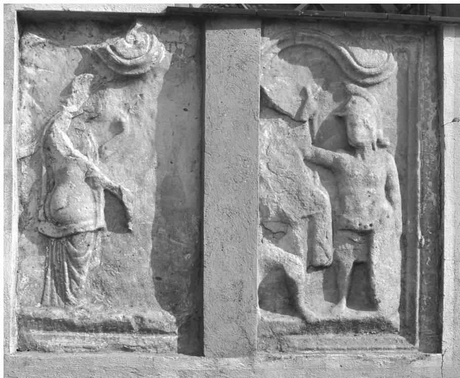
Fig. 5: Relief in Oswaldgraben, western Styria, Austria. Sl. 5: Relief v Oswaldgrabnu, zahodna Štajerska, Avstrija.