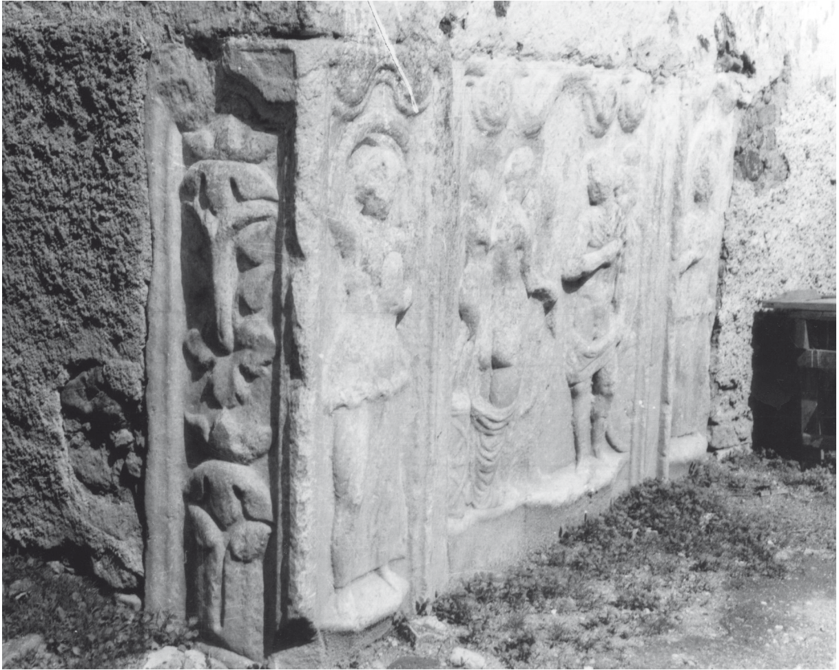
Fig. 3: Socle of a funerary monument at Gornji Grad, side view. Immured into the exterior wall, before 1955 (photo: F. Ugovšek).

Sl. 3: Spodnji del grobne edikule v Gornjem Gradu, pogled od strani. Vzidan v zunanji steni, stanje pred letom 1955 (foto: F. Ugovšek).