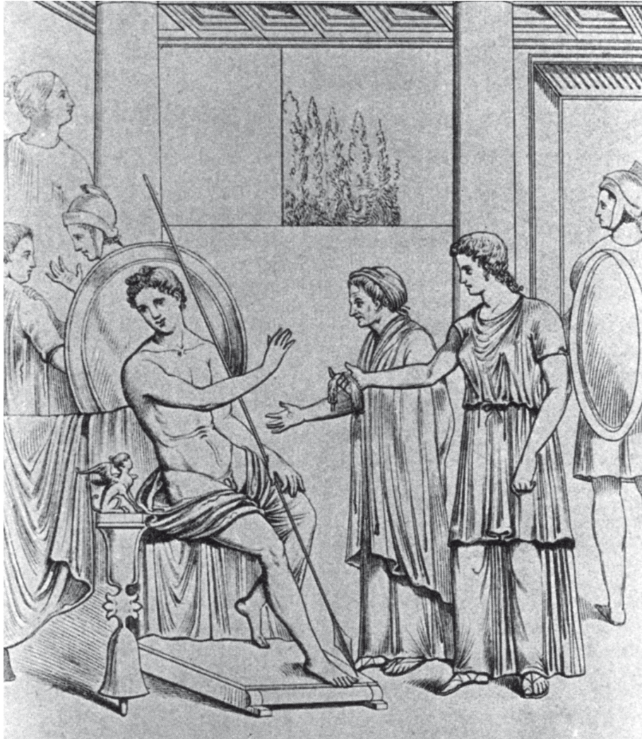
Fig. 13: Drawing of the fresco in Casa dei Dioscuri (VI, 9, 6–9) (after Hodske 2007). Sl. 13: Risba freske v Casa dei Dioscuri Pompejih (VI, 9, 6–9) (po Hodske 2007).

in the Ciris epyllion. The latter source also mentions Eros, whose intervention made Scylla fall in love with the enemy of her homeland – this would explain his pushing the female figure towards the male figure on the reliefs from Noricum and Pannonia, on the fresco from Domus Aurea , and also on the mirror from Bulla Regia . Although Diez and Kahil rejected Robert's interpretation of the fresco in Domus Aurea (cf. note 24), all these observations speak in favour of the hypothesis that the fresco in Domus Aurea (fig. 8), the mirror from Bulla Regia cemetery in Tunisia (figs. 9, 10), and the reliefs from Gornji Grad in Slovenia (fig. 4), Oswaldgraben in western Styria (figs. 5, 6), and Budapest (fig. 7) do not represent the reunion of Menelaus and Helen after the end of the Trojan War, but rather the fatal meeting between Minos and Scylla.