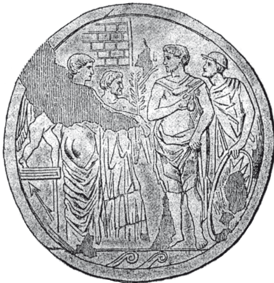
Fig. 10: Drawing of the bronze mirror from the Bulla Regia cemetery, Tunisia (after Vercoutre 1893). Sl. 10: Risba bronastega ogledala iz nekropole Bulla Regia v Tuniziji (po Vercoutre 1893).

her. 26 The literary sources and figural depictions are primarily in accordance with the figures of the nurse and Eros, the latter playing an active role also on all of the above-mentioned Norico-Pannonian