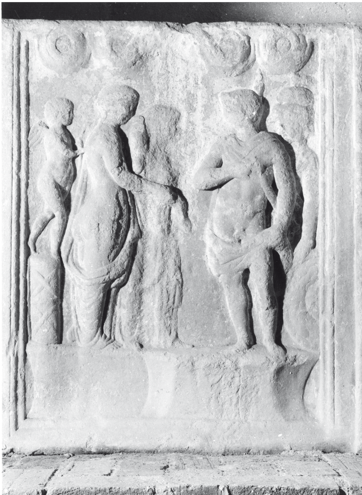
Fig. 4: Socle of a funerary monument at Gornji Grad, front slab. Depiction of Minos and Scylla. Sl. 4: Spodnji del grobne edikule v Gornjem Gradu, osrednji del. Prizor Minosa in Skile.