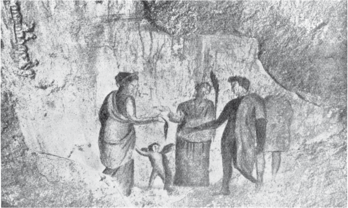
Fig. 8: Fresco in Domus Aurea (after Salis 1947). Sl. 8: Freska v Domus Aurea v Rimu (po Salis 1947).

above. The sword, which Menelaus lowers at the sight of Helen, already represents one of the main iconographical features of the motif in early Greek vase painting. 11