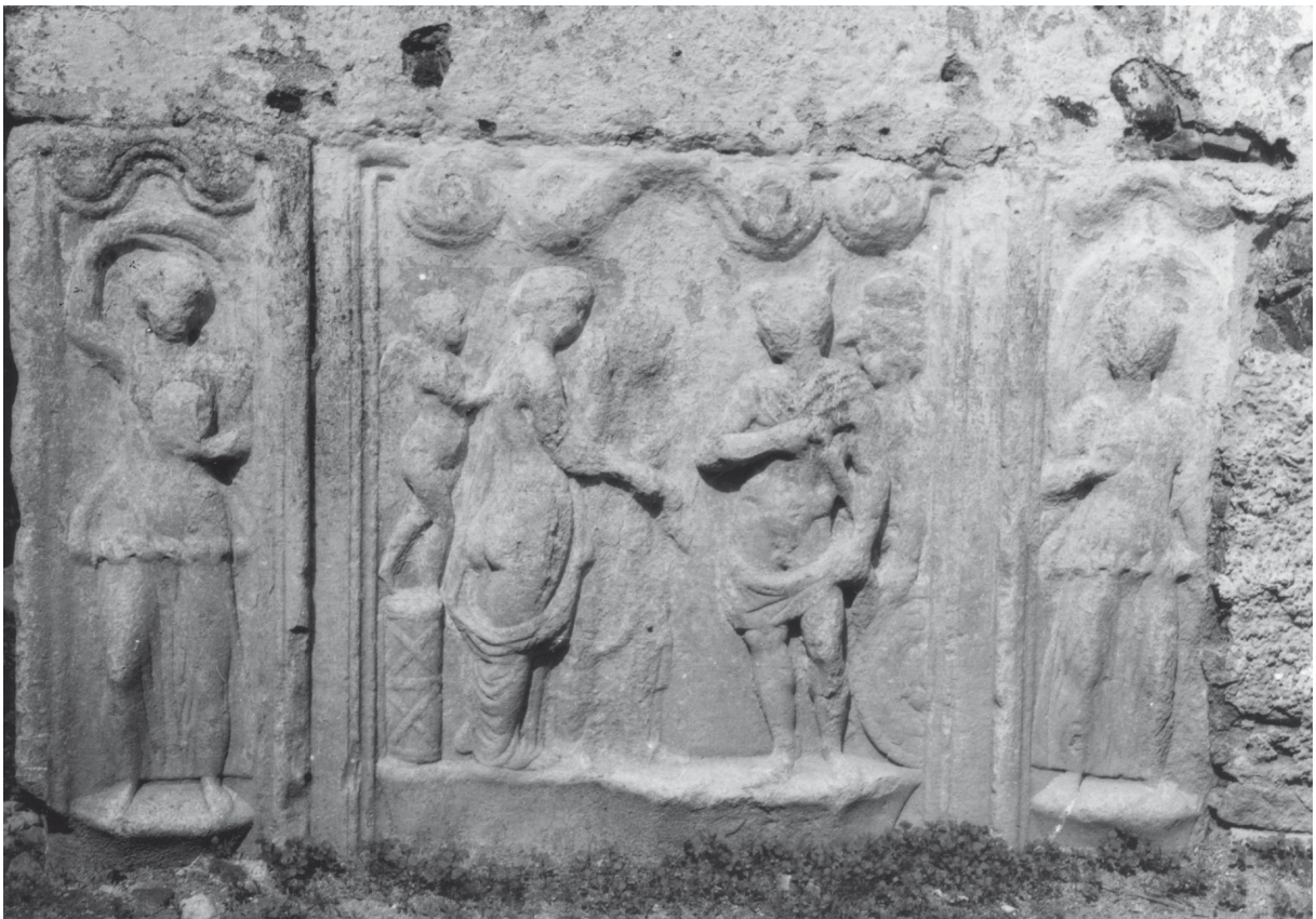
Fig. 1: Socle of a funerary monument at Gornji Grad. Immured into the exterior wall, before 1955. Sl. 1: Spodnji del grobne edikule v Gornjem Gradu. Vzidan v zunanji steni, stanje pred letom 1955.