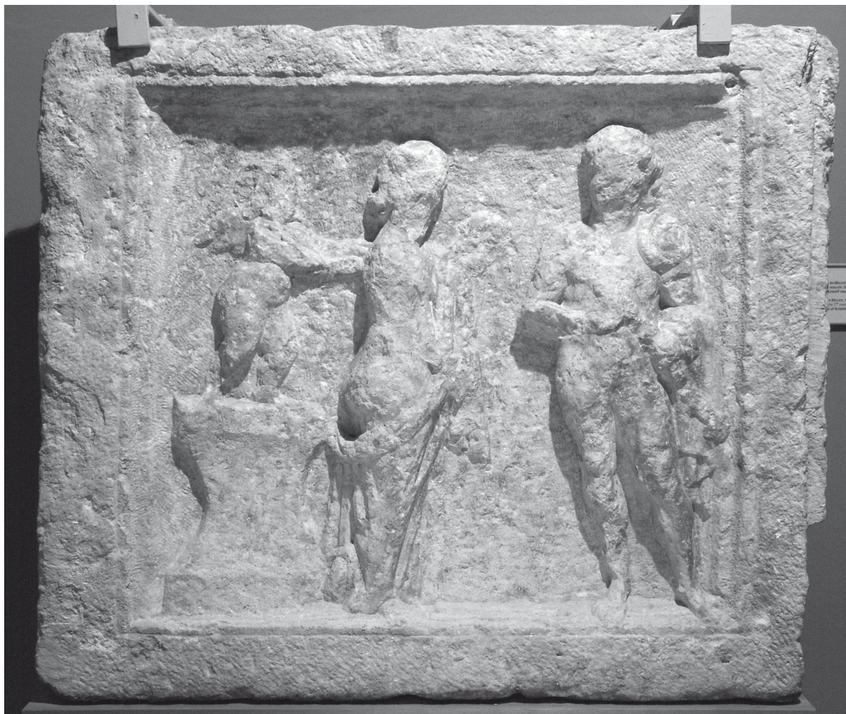
Fig. 7: Relief from Aquincum (Magyar Nemzeti Múzeum, inv. no. 72.1857,3). Sl. 7: Relief iz Akvinka (Mađžarski narodni muzej v Budimpešti, inv. št. 72.1857,3).

only be the goddess Aphrodite, whose intervention had thwarted Menelaus' evil intentions and rekindled his love for his wife. 10 Diez interpreted the two figures in the side panels as maenads, which frequently appear on Norican monuments.