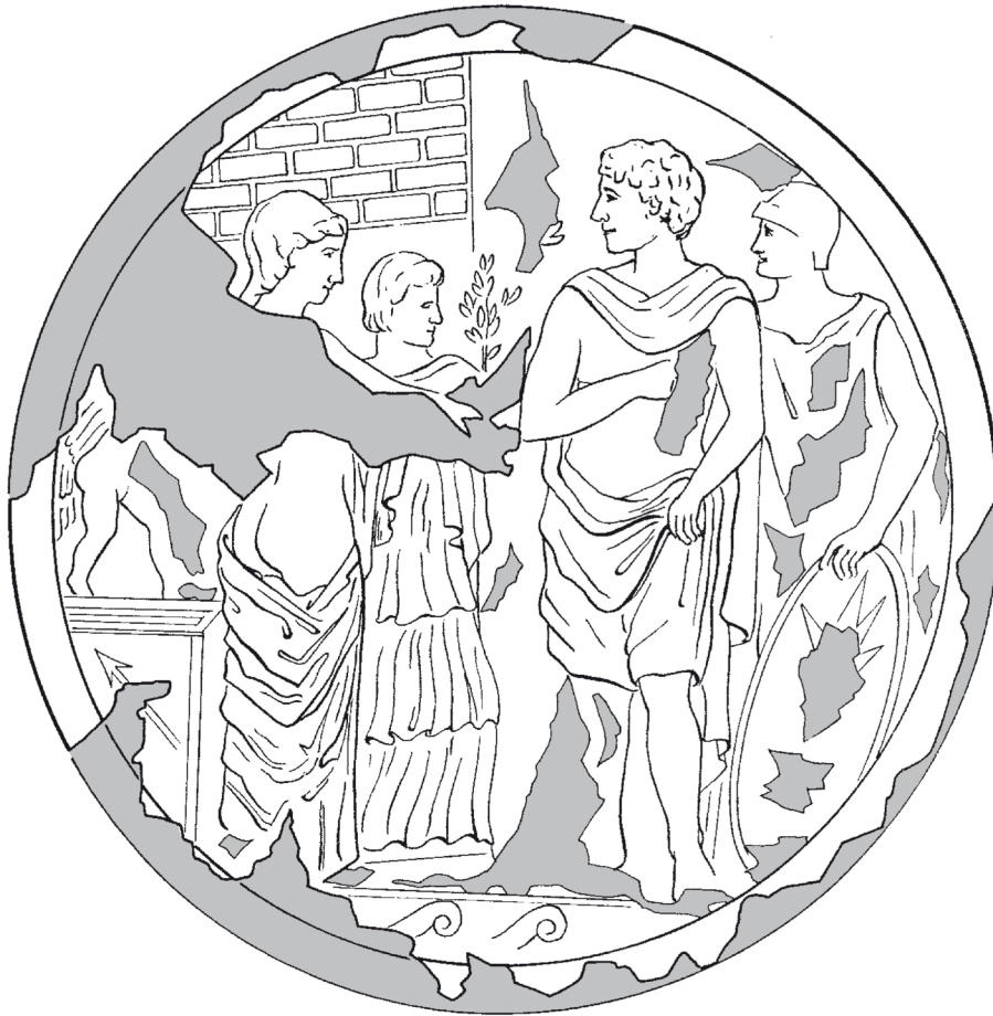
Fig. 9: Drawing of the bronze mirror from the Bulla Regia cemetery, Tunisia (after Zahlhaas 1975). Sl. 9: Risba bronastega ogledala iz nekropole Bulla Regia v Tuniziji (po Zahlhaas 1975).

latter as terrified and on no other depiction does she offer something to her husband.