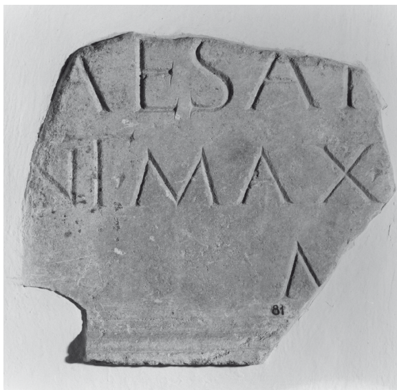
Fig. 5: Slab with an imperial inscription, probably a building inscription (AIJ 170b = ILJug 304 = RINMS 35).

Several years ago, Zsolt Mráv published a most interesting reconstruction of both fragments and their archaeological context. 27 He once again proposed connecting both inscriptions, not, however, identifying them as one and the same inscription but as two separate inscriptions, linked together by having both belonged to the city walls (fig. 6). According to him, each imperial inscribed slab