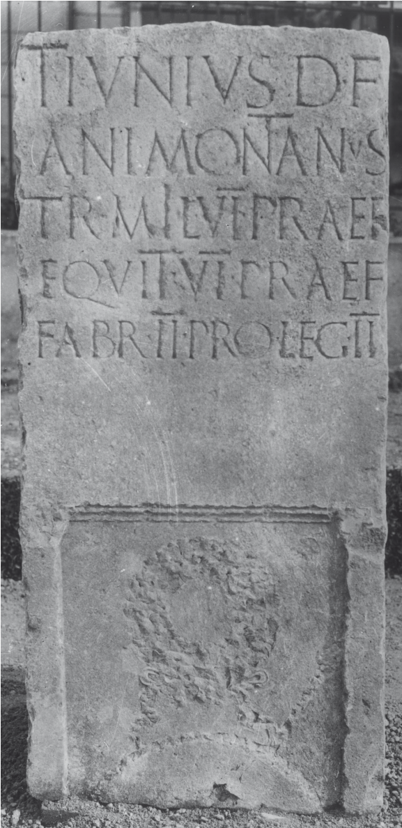
Fig. 7: The tombstone of T. Iunius Montanus (AIJ 173 = RINMS 36).

Sl. 7: Nagrobnik Tita Junija Montana ( T. Iunius Montanus ; AIJ 173 = RINMS 36).