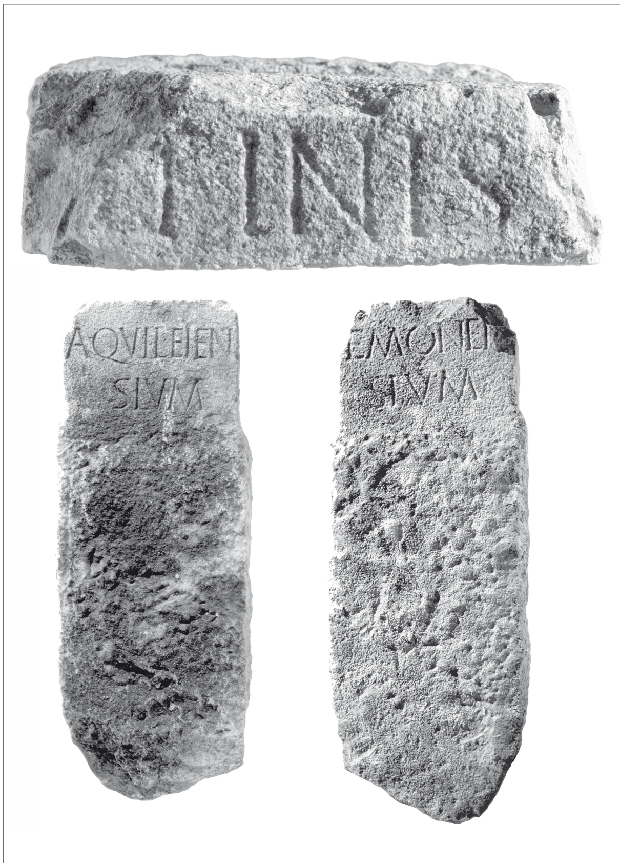
Fig. 3: The boundary stone between the territories of Aquileia and Emona (Šašel Kos 2002a, fig. 2). Sl. 3: Mejniki med upravnim območjem Akvileje in Emone (Šašel Kos 2002a, sl. 2).