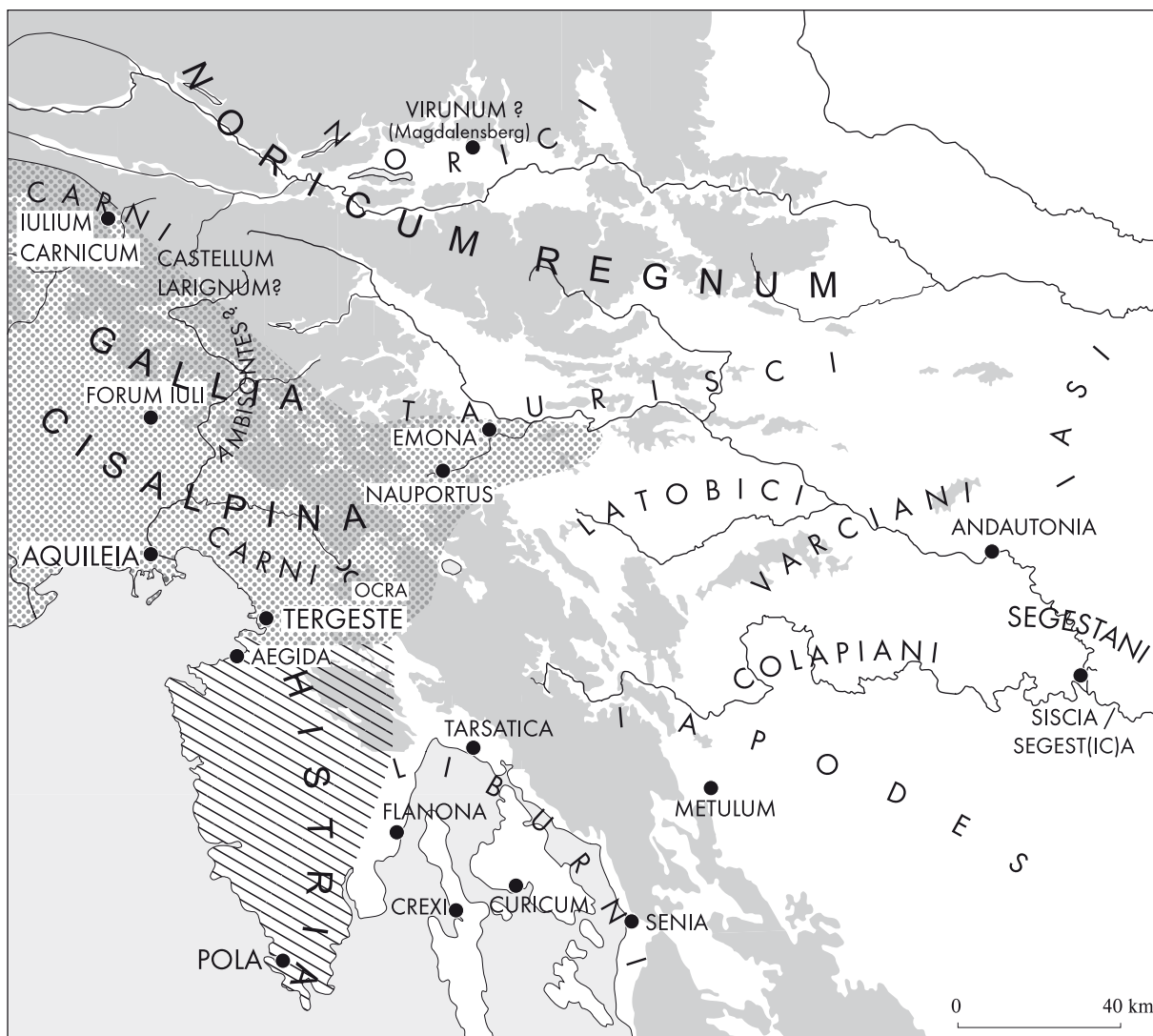
Fig. 2: Cisalpine Gaul at the time of Caesar (adapted from Šašel Kos 2005, 341 fig. 81).

Sl. 2: Cisalpinska Galija v času Cezarja (prirejeno po Šašel Kos 2005, 341 sl. 81).