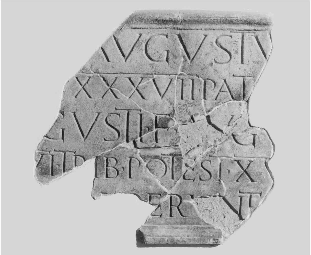
Fig. 4: The building inscription of Augustus and Tiberius (CIL III 10768 = AIJ 170a = ILJug 303 = RINMS 34). Sl. 4: Gradbeni napis Avgusta in Tiberija (CIL III 10768 = AIJ 170a = ILJug 303 = RINMS 34).