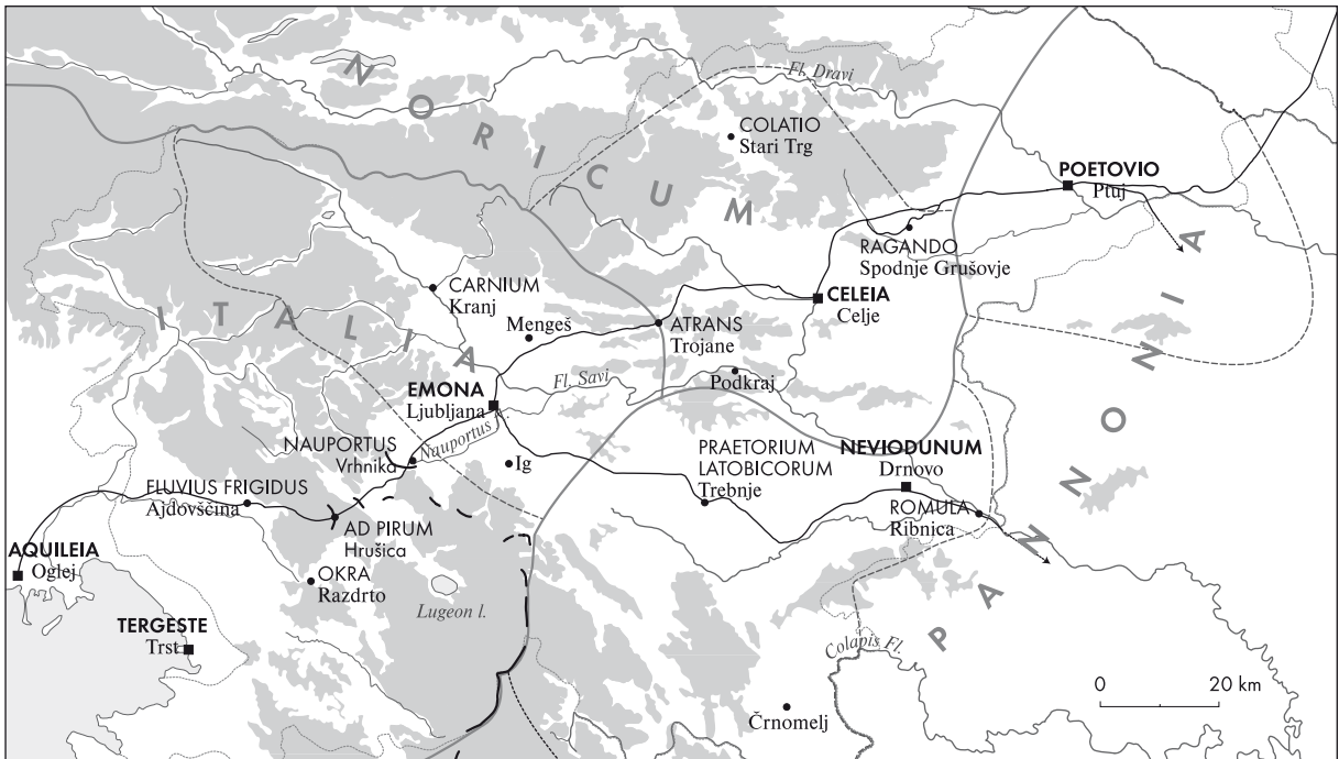
Fig. 1: Map showing the triple border region between Italy, Noricum, and Pannonia. Sl. 1: Zemljevid, ki prikazuje prostor tromeje med Italijo, Norikom in Panonijo.