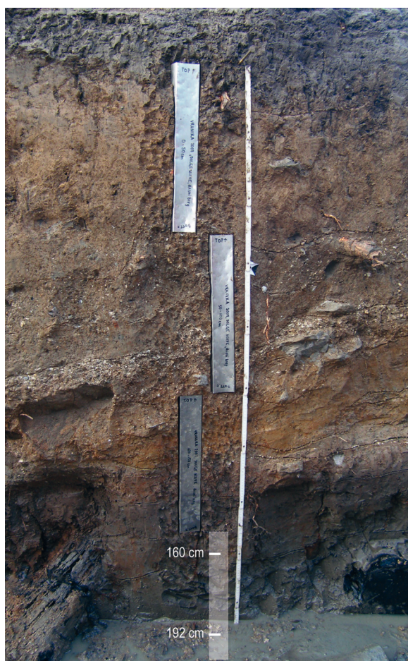
Fig. 3: Vrhnika, Dolge njive. Palynological stratigraphic column, collected from the northern cross section of archaeological Sector 1 (Cross section C–D).

Sl. 3: Vrhnika, Dolge njive. Palinološki stratigrafski stolpec, vzorčen na severnem profilu izkopa 1 (profil C–D).