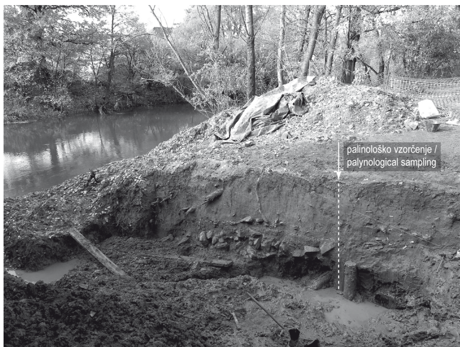
Sl. 2: Vrhnika, Dolge njive. Severni profil izkopa 1 (profil C–D).