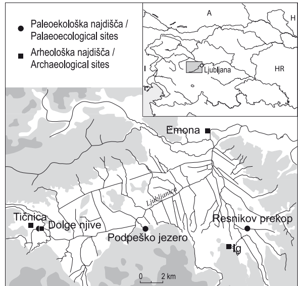
Sl. 1: Ljubljansko barje z označeno lego najdišča Dolge njive na Vrhniki ter arheoloških in paleoekoloških najdišč, ki se omenjajo v besedilu.

Rezultati dosedanjih palinoloških raziskav torej kažejo, da se je večja sprememba v sestavi vegetacije na Ljubljanskem barju (intenzivno izsekavanje gozda in nastanek današnji podobne pokrajine) zgodila v drugi polovici prvega tisočletja pr. n. št.