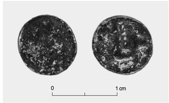
Fig. 1: Tauriscan obol from the Lobar hillfort. Scale = 3:1. Sl. 1: Tavriški mali srebrnik z loborskega gradišča. M. = 3:1.

The obol – a small LIA silver coin 4 – found at the Lobar hillfort cannot be precisely classified with respect to the hitherto published Tauriscan obols. 5 It can, however, be generally associated with certain typologically differentiated groups of these small LIA coins. In terms of typology, metrology and style, it is most akin to an Augentyp-Stamm after KNS 749–755 group of obols from Celje, more precisely, from the bed of the Savinja River, of a median weight of 0.2 g (0.596–0.429 g) ( Fig.