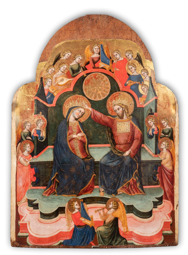
2. Stefano "plebanus" di Sant'Agnese, Coronation of the Virgin, 1381, Gallerie dell'Accademia, Venice