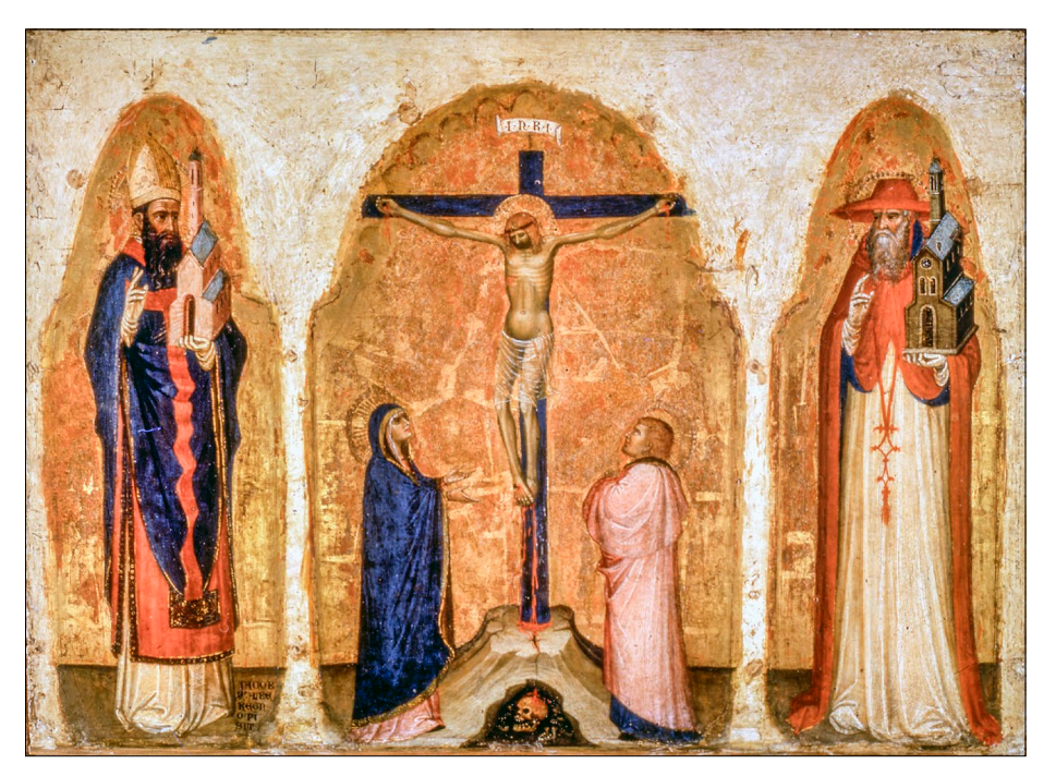
3. Jacobello Alberegno, Triptych of the Crucifixion: Christ Crucified between the Virgin, Saint John, Saint Gregory, and Saint Jerome, after 1380, Gallerie dell'Accademia, Venice