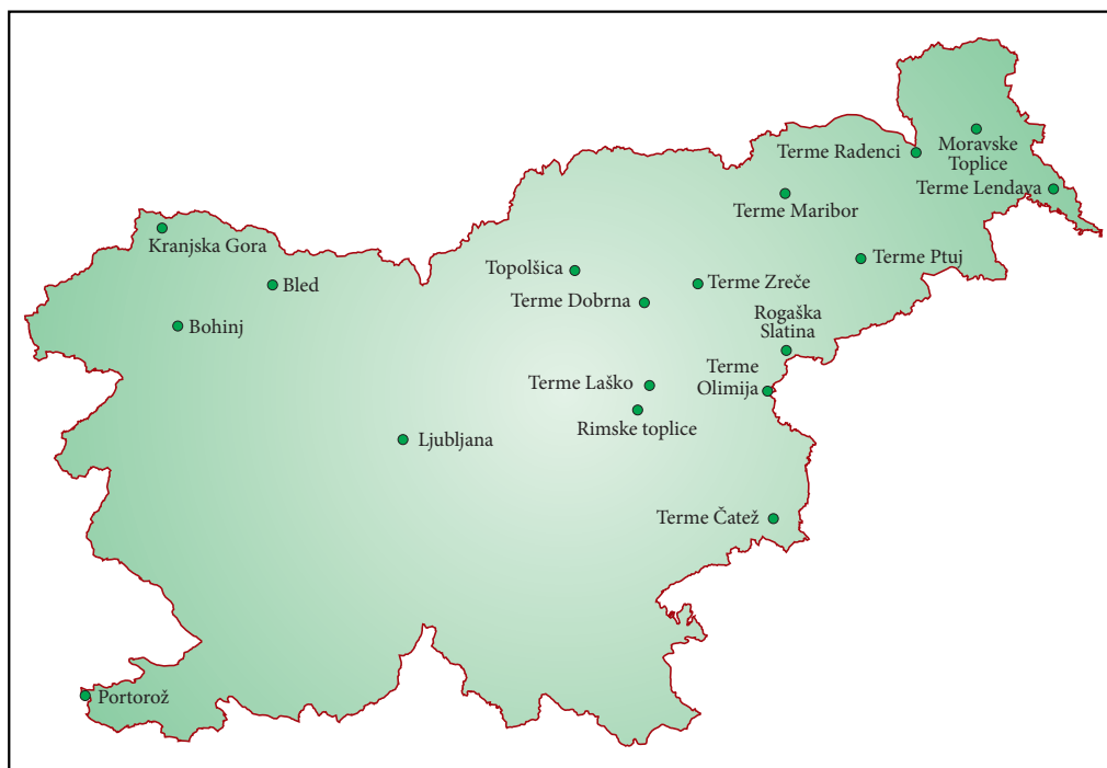
Figure 1: Spatial distribution of Slovenian spas.

Slovenia is a country of exceptionally diverse landscapes at the intersection of four major European macroregions: the Alpine, Pannonian, Dinaric and Mediterranean regions. The great diversity of landscapes and the easy availability of the country influences the fact that this country has the opportunity to develop a different type of tourism (Ažman Momirski and Kladik 2009). One of the most developed is the spa tourism,