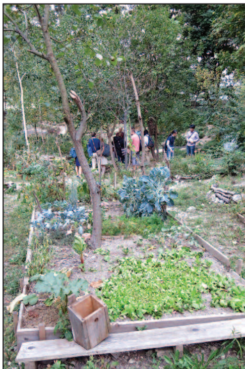
SASA POLJAK ISTENIC