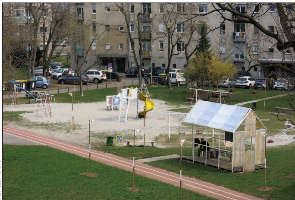
SAŠA POLJAK ISTENIČ

A local inhabitant, who took me on a tour through the neighbourhood when asked to explain recent changes and his view of a place, pointed out marked paths to school, renovated school playgrounds, children's playground and sports field, fruit trees and cleaned hill, renovated city library and the Knjižnica reči / Library of things . The latter is a place established to encourage ethical sharing economy, as its members