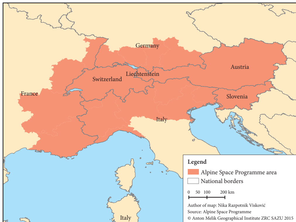
Figure 2: Regions included in the Alpine Space transnational cooperation program.

tainable use of natural and cultural heritage, conserving and developing the ecological connectivity of Alpine ecosystems, and promoting multilevel governance.