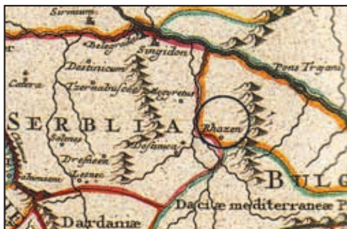
3.1. Rhazen (Guillaume Delisle, Eastern Empire and surrounding regions according to Constantine Porphyrogenitus, 1718).