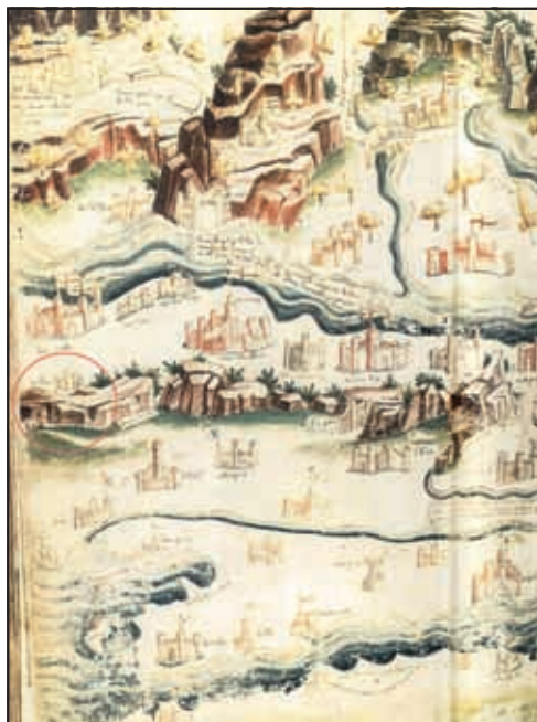
Figure 1: Part of the military map of the Balkans (Oračev 2005).

Serbia and Bulgaria. The map by the prominent French cartographer Guillaume Delisle, »Eastern Empire and Neighbouring Regions According to Constantine Porphyrogenitus«, shows Rasa (German: Ratzen) on the Serbian-Bulgarian border, but on the Bulgarian side (Grčić and Grčić 2012, 8). According to Dinić (1966), it should not be excluded that Porphyrogenitus' Rasa belonged to Bulgaria. In any case, it is a border fortress between the two countries (Grčić and Grčić 2014).