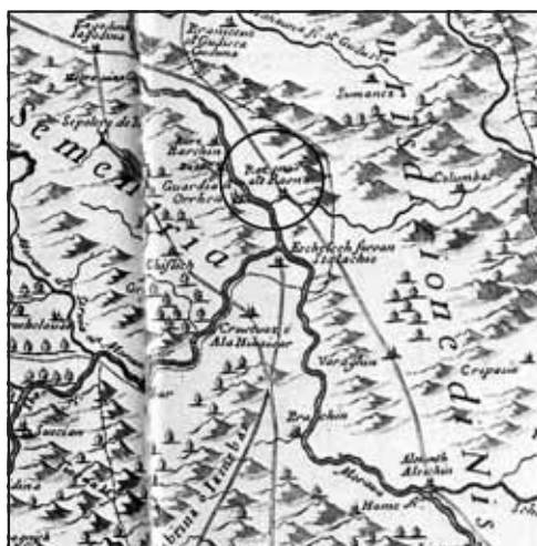
3.6. Razena alt (ats), Rasna (Giacomo Cantelli da Vignola, Map of Serbia, 1689).