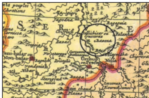
3.2. Rasena (Guillaume Delisle, Map of the Hungarian Kingdom, first quarter of the eighteenth century).