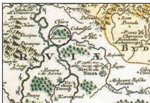
3.4. Razena (Mattheus Seutter, Map of Transylvania, Moldavia, Walachia, Bulgaria, beginning of the eighteenth century).