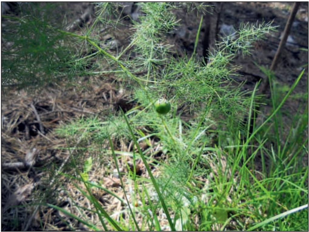
Figure 1: Wild asparagus.

Slovenian forests are classified into four levels of potential fire risk – very high, high, medium, and low (Jakša 2006). Of the fourteen forest management areas (GGO) Sežana is the most fire endangered (Poročilo ... 2014). The high fire risk of the Submediterranean Slovenia stems from physical as well as human geographical factors. The climate, with high temperatures and dry season, plays an important role. The carbonate bedrock with great permeability reduces water retention, thus increasing drought and the probability