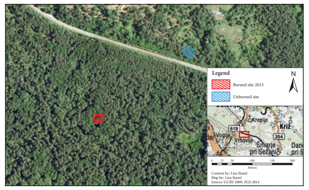
Figure 4: Location of sampling plots at Podgovec.