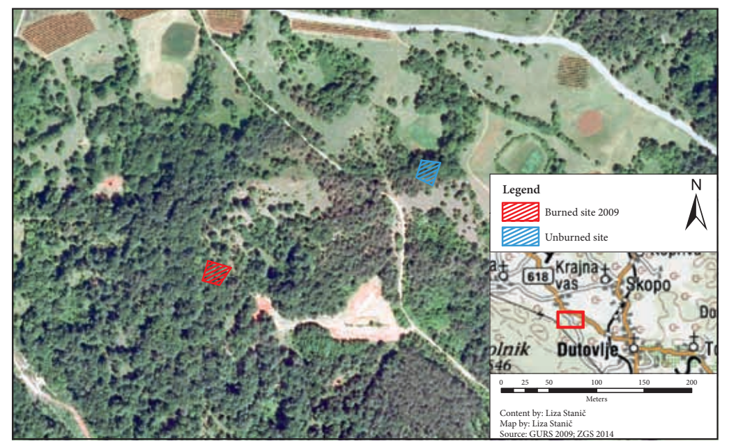
Figure 3: Locations of sampling plots at Kamarija.

present (Lovrenčak 2003). The method is enables quick and accurate vegetation sampling as well as an analysis of species-habitat relationships (Wikum and Shanholtzer 1978). Species were identified using botanical identification keys (Pintar and Wraber 1990; Lippert 2000; Fletcher 2007; Schauer 2008; Lang 2013).