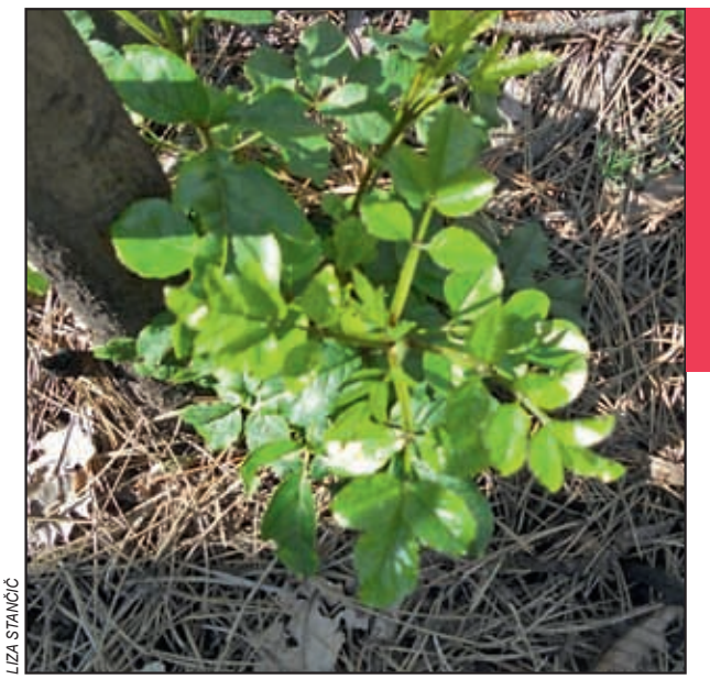
A young shoot at the base of a flowering ash scrub that had been scorched in a wildfire.