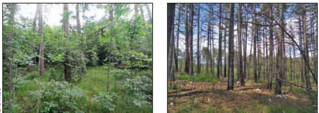
Figure 6: Podgovec burned site (left) and unburned comparative site (right).

separated by a railway line. Due to these characteristics it can be assumed that the comparative site was not affected by the fire (Figure 6). Traces of fire are clearly visible on the burned site – tree trunks are scorched to a height of 3.5 m, the forest floor is covered with remains of charred twigs and cones.