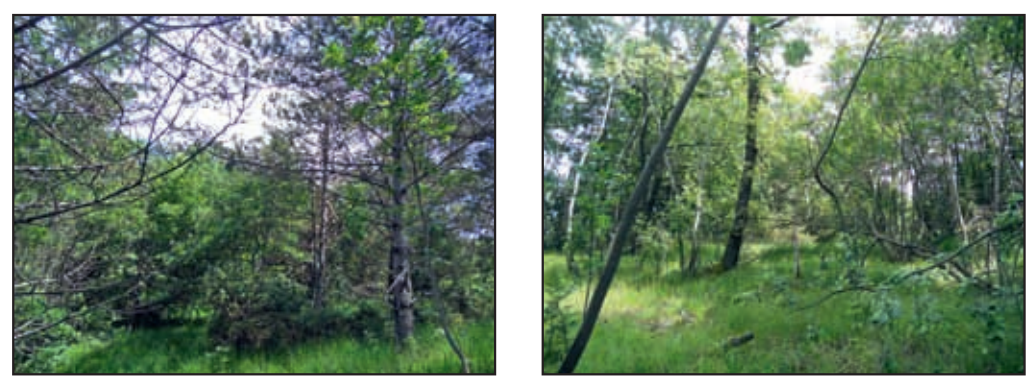
Figure 5: Kamarija burned site (left) and unburned comparative site (right).

Table 2: Comparison of the breast height circumferences and the heights of trees on the Kamarija burned site and unburned comparative site.