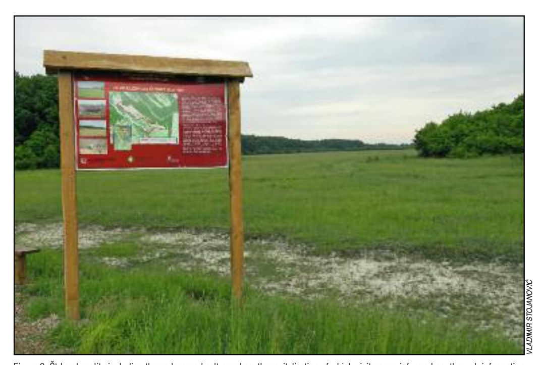
Figure 2: Štrbac Locality including the endangered salt marshes, the revitalization of which visitors are informed on, through information boards.

So far, the impact of nature on villages around the Reserve Gornje Podunavlje was most prominent in the area of affirmation of cultural heritage and the development of awareness of cultural identity and pride in being one of the key factors of sustainable development and ecotourism. Local heritage can be analyzed through the list of protected monuments in the area of Special Nature Reserve Gornje Podunavlje. In the registered settlements, 39 cultural monuments, places of interest, geographical cultural and historical sites have been documented (Folić - Kurtović et al. 2008). These include churches, chapels, homes of famous people, houses as valuable architectural monuments, a castle and two town cores. Some of them are well known from before, for example, the protected town cores of Sombor and Apatin. Those environmental