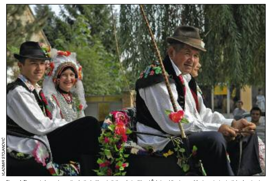
Figure 4: The event of grape harvesting festival with an imitation of a traditional Šokci wedding is one of the important potentials of ecotourism and rural tourism of Gornje Podunavlje.