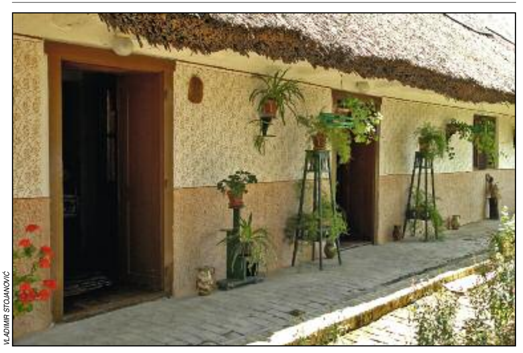
Figure 3: Ethno-house Bodrog in Bački Monoštor.